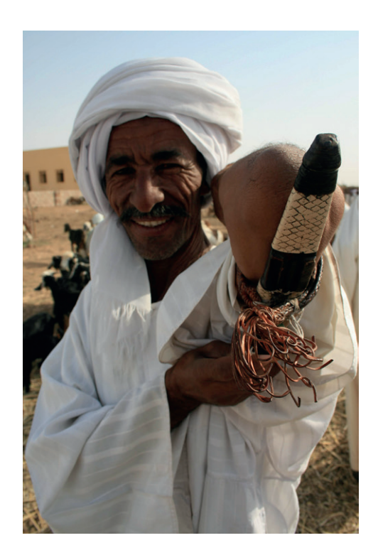
Photo 4. "Jallaba" – a merchant from Northern Sudan, Debba.

Within the territories of the Luo, Bongo or Dinka people, the traders set up temporary slave factories - the so-called enclosures (from Arabic zaraib). These were places of contact between hunters-and-traders and representatives of local tribes who were intermediaries in acquiring people. Slave hunters were quite poor people, who supplemented their low income by means of slaves. Some of these slaves (juveniles and women) were sold in the local market or taken for personal use in the home regions (Breidlid et al. 2014, 112-113). It was then in the North that the possession of slaves probably became quite common. They were used in the field when needed or as cheap domestic servants. Black women, considered particularly attractive, became concubines or legal wives. A slave's fate was not doomed forever. A slave belonged to a community, participated in its life and could even become a legitimate member of this community. Usually they enjoyed little prestige, but were allowed to assimilate (for example by way of religious conversion). Becoming a Muslim, however, did not translate into increased freedom since their origin remained unchanged, and they were still dependent. The best they could be was a client (someone who needs permanent protection and representation) or a servant for a part of the society considered more