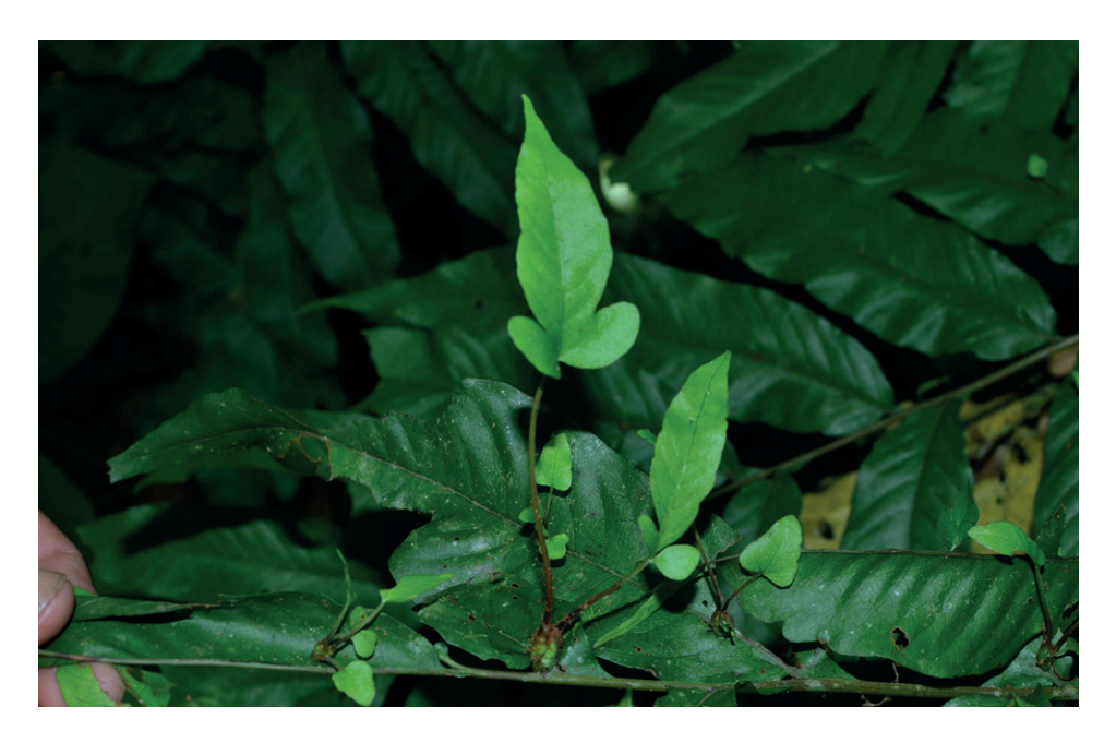
Figure 2. Leaves of ohoairontsiki ( Tectaria incise ) used to improve women's fertility. They are consumed in a way that a woman may choose the sex of the baby: when long leaves are ingested, it is for a boy ( chirampari ) and whereas round leaves, it will result in a girl being born ( tsinane ).