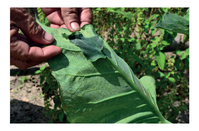
Figure 1. Leaves of Xanthosoma cf. sagittifolium which resemble vagina. The starchy tuber of this plant is used as a pusanga.

Plants are present in all spheres of the Ashaninkas' life. Their role and their healing properties stem from their position in an overall network of relations between humans and non-humans (see also Lenaerts 2006). The etic division between medicinal and non-medicinal plants should be treated more as an convention made for analytical purposes, rather than a reflection of these people reality. Medicinal plants are often linked to diet and food proscriptions and are used to counteract the malicious behaviour of many different kinds of insects. The latter, especially ants, are seen as troublemakers by the Ashaninka. Many etiological concepts of illnesses are built around malevolent insects. The widely held assumption is that when a husband or a wife has extramarital sexual relations, she/he becomes infected with "bugs" ( bichos ). Table 1 contains details about plant use in cases of partner infidelity, as well as information about plant pusangas – love potions related to love magic (see also Figure 1).