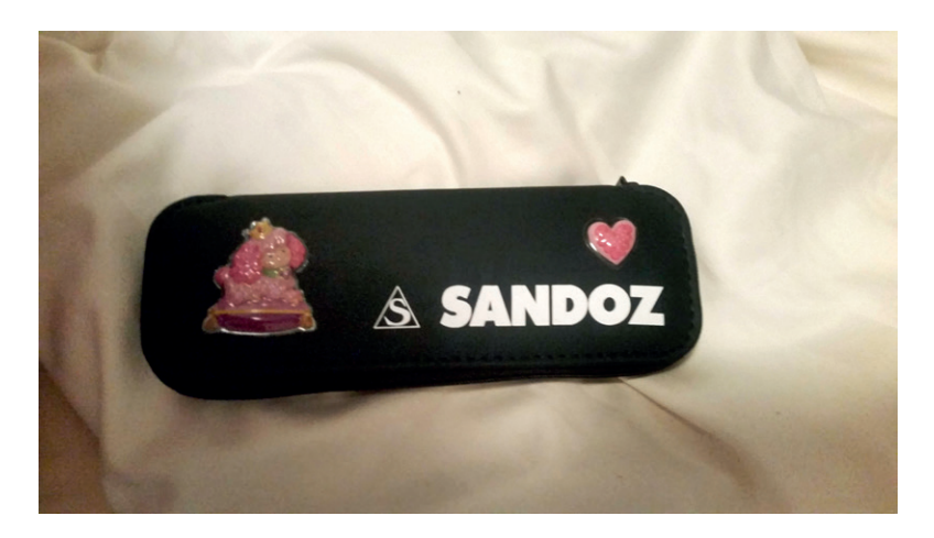
Pen injector case

The transition from a thick-needle and a syringe to a delicate injection pen, just as in the case of other medical technologies, can be described as a process of miniaturization, normalization, obscuring/concealing<sup>8</sup> and blurring the boundaries between technology and the body and its everyday reality. Something crass and bulky (emphasized by Maria's mom in her story about a plastic bag and thick needles) transforms into something more delicate. A wad of cash has turned into a transfer of information and medical documents. From obtaining the hormone from pituitary glands of cadavers we have moved on to recombinant DNA in a lab employing specialised genetic engineering.