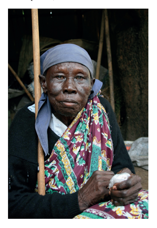
Photo 3. A women from the Madi tribe, one of the many societies of South Sudan affected by slavery, Juba.

Sudan developed the practice of plundering raids in the south. Then slave hunters expanded their activities from areas of the Blue Nile or the Nuba Mountains into the heart of today's South Sudan. Nearly all communities inhabiting South Sudan today were the victims of slavers (photo 3).