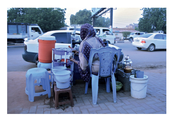
Photo 2. A "women of tea" on Forty Days Road Street, Omdurman.

A good example of the existence of slavery in contemporary Sudan is the institution of roadside mini-cafes run by women – mostly poor migrants from peripheral or war-torn regions of Sudan – on Forty Days Road Street, one of the main streets of Omdurman (photo 2).