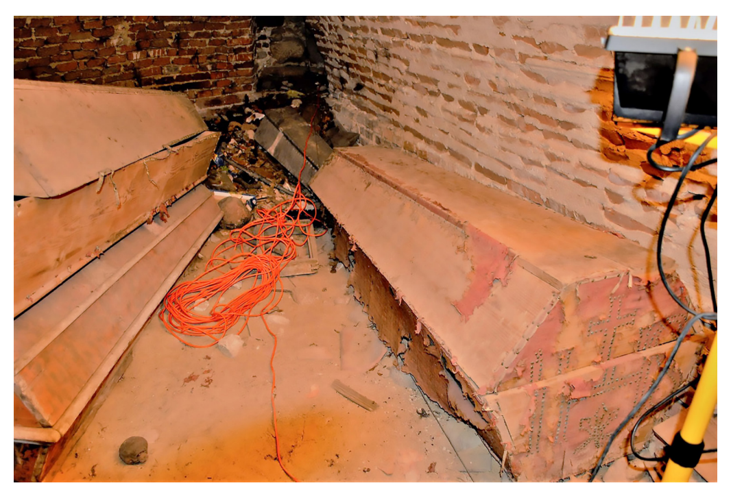
Fig. 3. Szczuczyn. Back of the crypt.