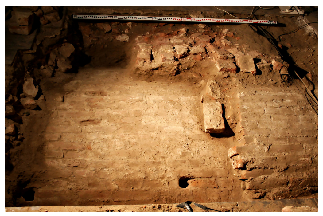
Fig. 1. Gniew. The vault of the crypt beneath the floor of St. Anne's chapel.