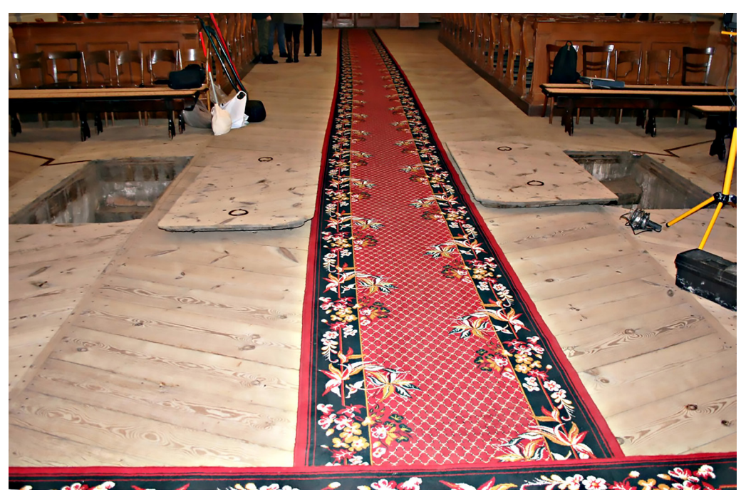
Fig. 2. Szczuczyn uncovered entrances to the crypts.

Objects of that kind are often tourist attractions or religious pilgrimage destinations and generate the flow of thousands of visitors. People thought-lessly litter them, leaving various rubbish everywhere. Because of different historical disruptions over the course of centuries, many of these structures are still being restored to recreate their faded beauty. Before starting archaeological excavations, researchers are forced to remove all kinds of waste left by 20th century populations first (Fig. 3), before they start proper