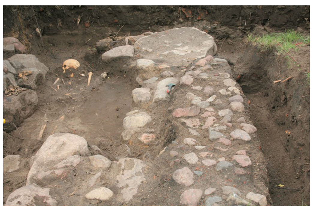
Fig. 4. Płonkowo. Foundations of the destroyed church.

In many examples, apart from objects closely related to burial practices, we find artefacts from the everyday life of the deceased, which help us to understand better changes which took place in towns and villages. They are always sensational and generate significant tourism development in the region, and possibilities to obtain funds for further exploration work or to influence a sense of local identity between present and past communities (e.g. Gniew, Piaseczno, Płonkowo and Szczuczyn). In theory, these are only positive effects