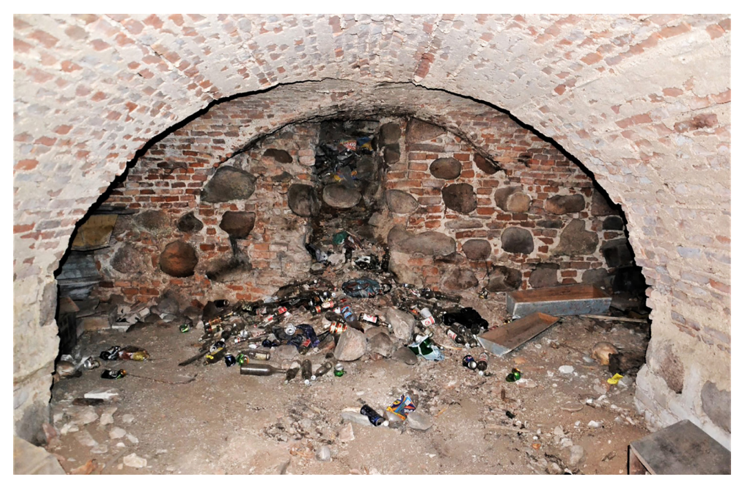
Fig. 9. Szczuczyn. Interior of the third crypt with ventilation shaft in the centre.