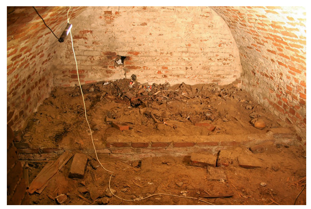
Fig. 5. Gniew. Interior of the crypt. Photo D. Grupa.