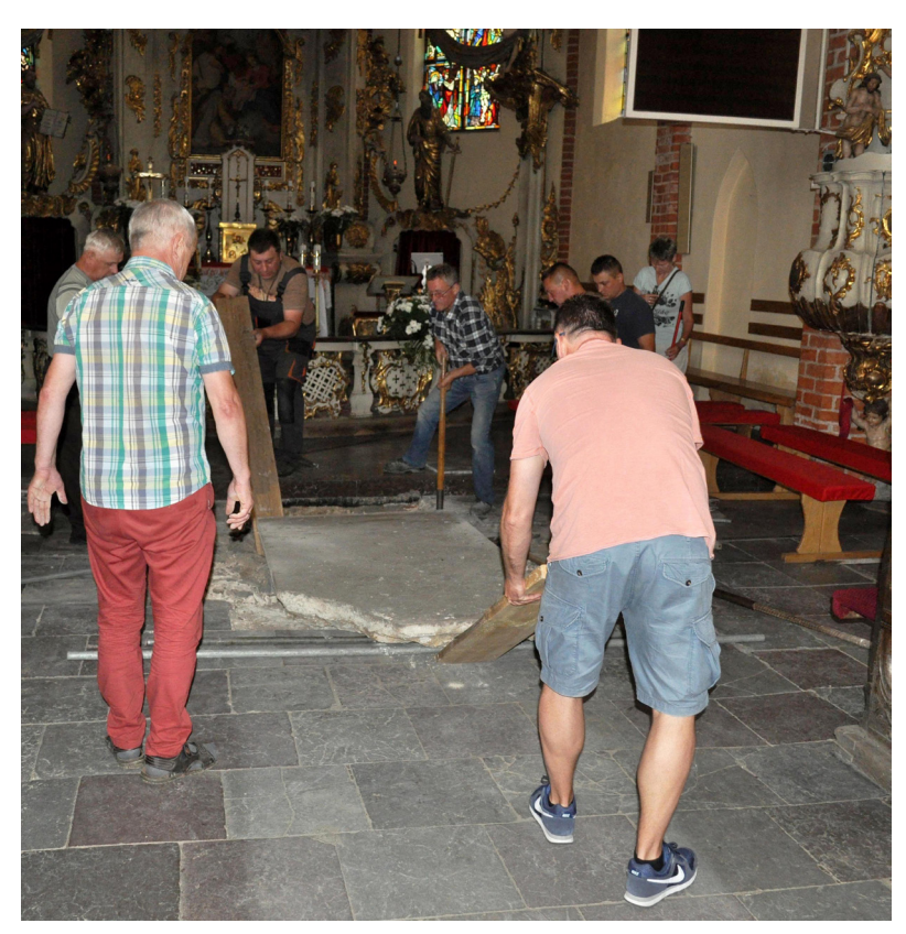
Fig. 14. Piaseczno. Opening of the crypt under the chancel.