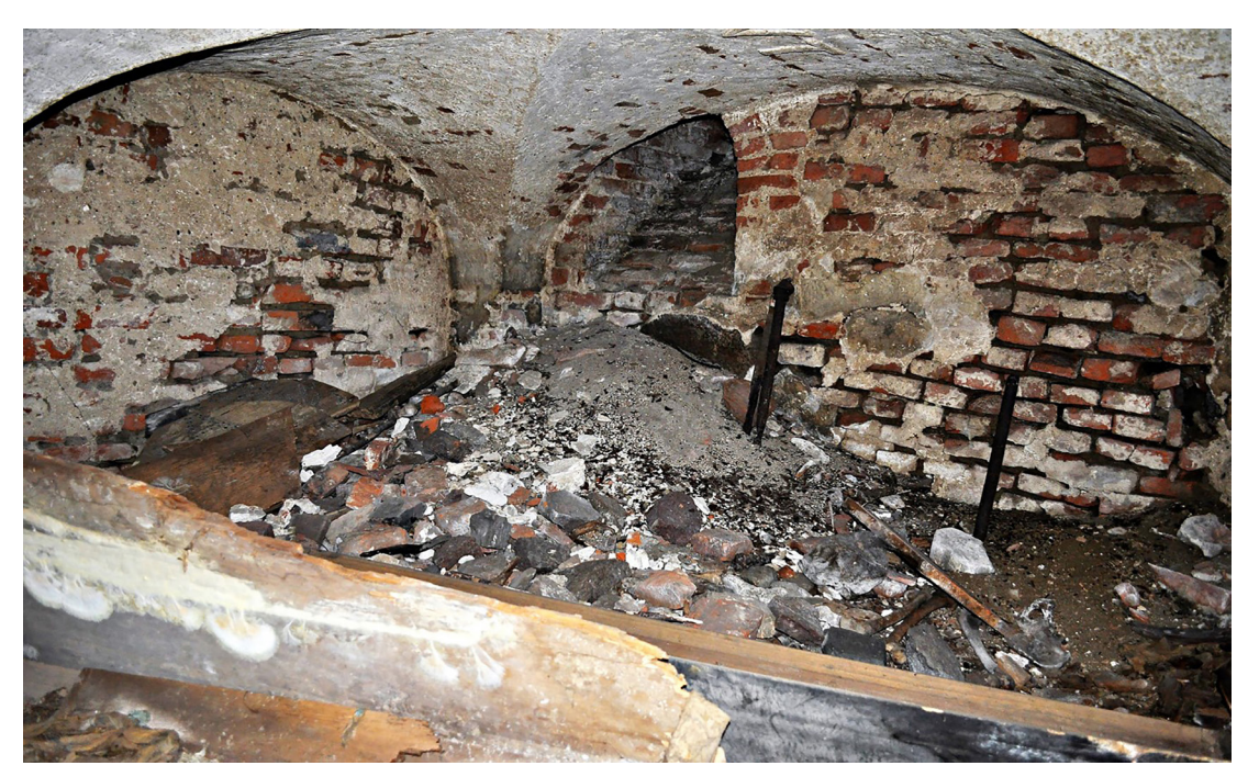
Fig. 16. Piaseczno. Garbage from ventilation shaft after removal of the coffins.