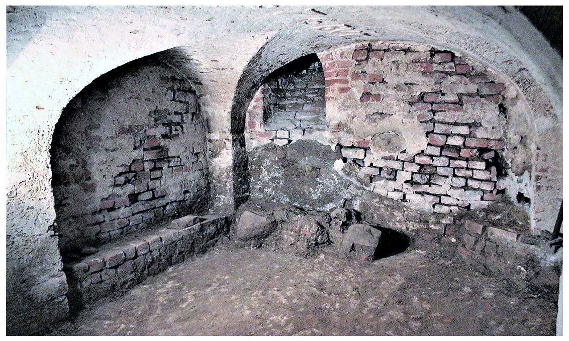
Fig. 17. Piaseczno. Original level of the crypt discovered after removing coffins, garbage and soil.

plaster. According tolocal inhabitants, in the 20<sup>th</sup> century the crypt was often visited by children playing truant from school. Because they were small enough to get through the ventilation hole, children would hide inside from local school teachers. The ventilation opening was partly bricked up in the 1980s at the request of the parish priest. Having opened the crypt, archaeologists found some of the coffins destroyed, while others were cleaned and put against the walls (Fig. 15). Protecting the interior from microorganisms, inventory and classification works