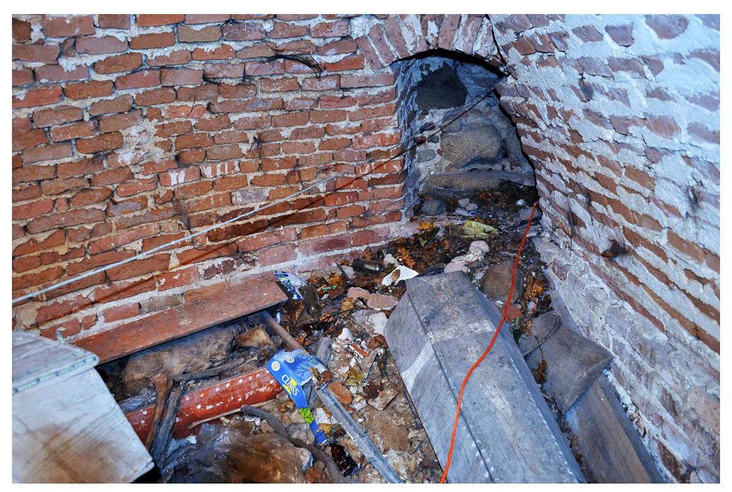
Fig. 7. Szczuczyn. Passage between two crypts connected to the ventilation shaft.