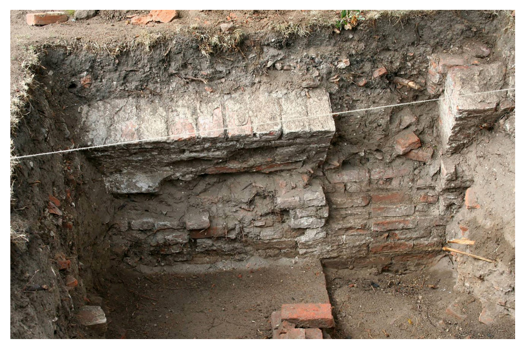
Fig. 18. Płonkowo. Entrance from the outside to the crypt blown up by Nazis during World War II.

some of the layers of dirt, we found a fragment of white-washed pugging, marking the original level of the crypt. During many years of intrusion into the crypt, the floor level rose about 40 cm, covering the foundation stones, and this led to free water penetration inside the walls (Fig. 17). Next biocides were sprayed inside and the entrance was closed again for 12 months, after which period the following works were planned.