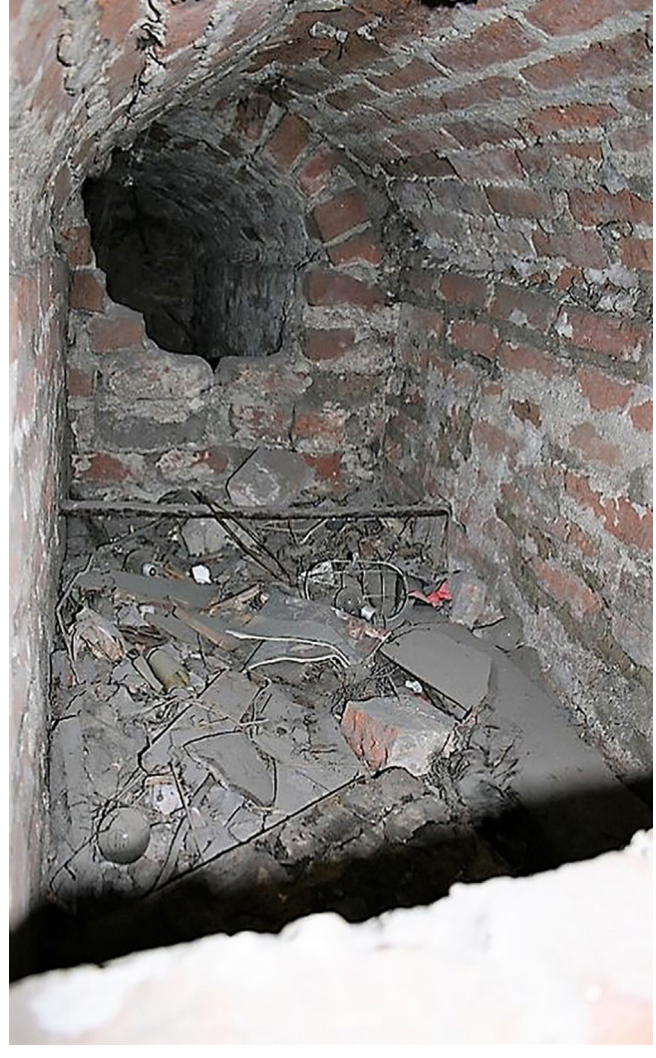
Fig. 11. Warsaw. Grave niche filled with garbage collected over the years inside the crypt.