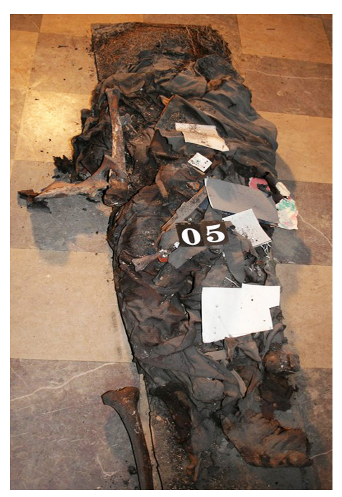
Fig. 13. Warsaw. Human remains, burial clothes, and garbage in coffin no. 5.

of the martens' diet, and even a bicycle pump. After more detailed examination it turned out that coffin lids were also damaged by rodents, which made their dens inside (Fig. 6). The lids also had signs of animal claws and part of the planks was gnawed by vermin. Martens and other predators, and litter entered the crypt via the ventilation hole.