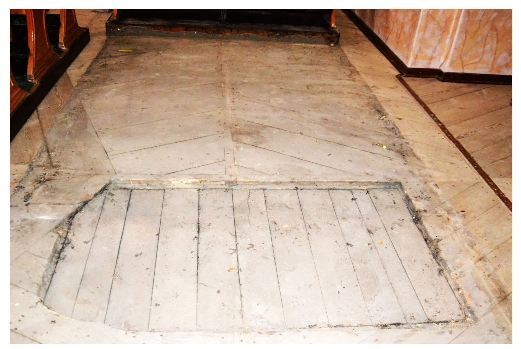
Fig. 8. Szczuczyn. Entrance to the crypt under the benches on the right side of the central nave.

exploration, archaeologists usually do inventory work inside studied objects, finding surprising artefacts or signs of human or other natural activity, which has had a negative impact on the site.