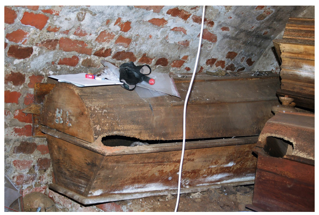
Fig. 6. Gniew. Signs of animal claws on coffins and holes in the planks gnawed by martens.

and their behaviour may be far from respectful to religious sites. This can be illustrated best by the cases of all kinds of crypts situated under churches floors. Sometimes they are excavated by accident, such as the crypt under the floor of St. Anne's chapel in the Church of St. Nicholas in Gniew,<sup>7</sup> and sometimes they are well known and located inside churches, such as that of the