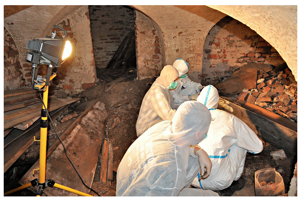
Fig. 15. Piaseczno. Entrance and interior of the crypt.

that a part of burials had been moved to other chests (Fig. 12), and their interiors were filled with objects not connected with the deceased (Fig. 13). Mostly these were of 20<sup>th</sup>-century origin, such as public transport tickets, pieces of newspapers, cigarette ends, and even condoms).