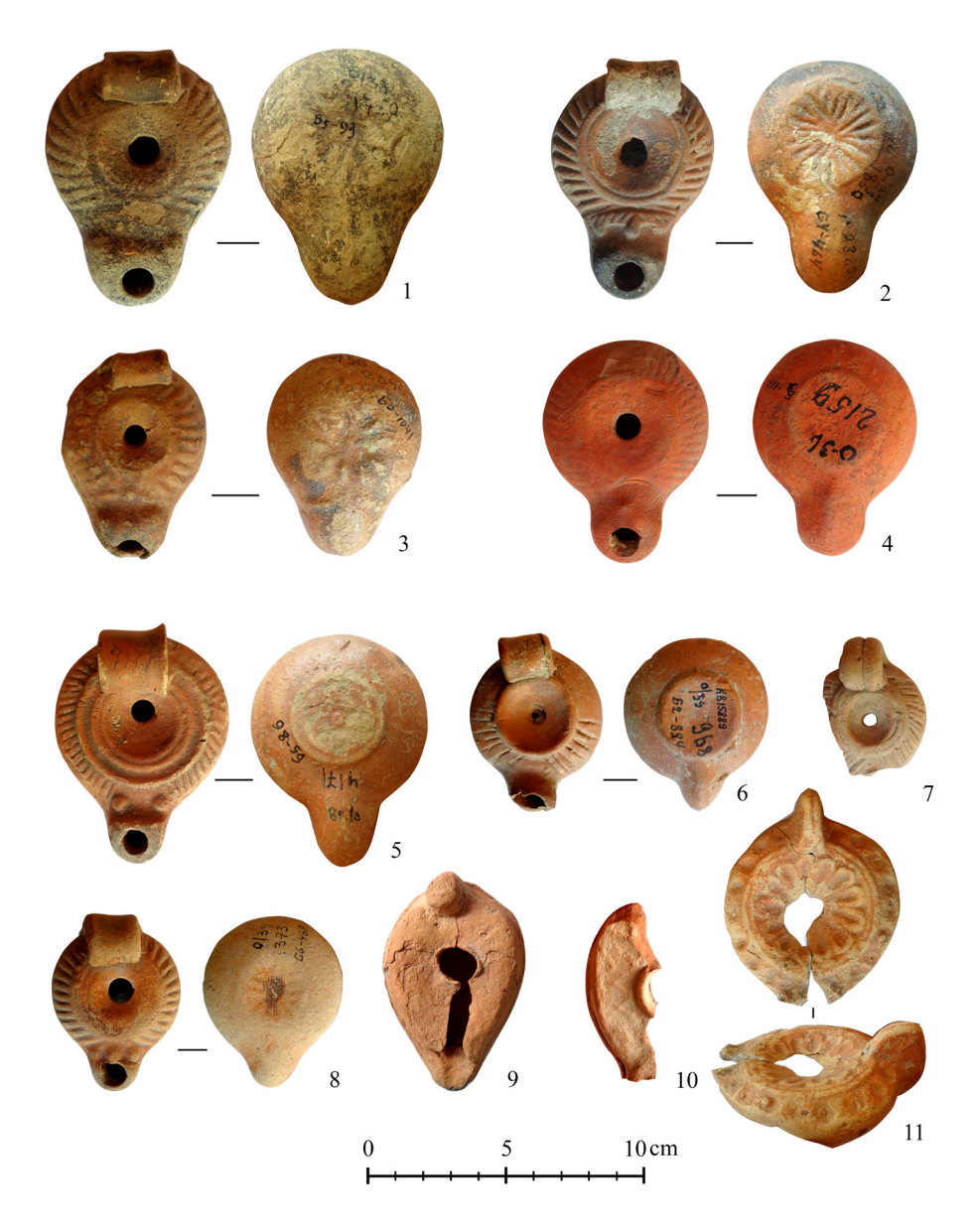
Fig. 1. Inventory numbers of the lamps: 1 – O-38/1750/Б5/93; 2 – O-38/2346/Б5/1041; 3 – O-37/1850/Б4/464; 4 – O-36/2159/Б3/117; 5 – O-38/4171/Б5/86; 6 – O-39/968/Б2/824/ кв.15889; 7 – O-38/1425/Б5/1083; 8 – O-39/1373/Б6/468; 9 – O-2008/R-25/1017; 10 – O-87/R-25/161; 11 – O-38/1053/Б5/1085.