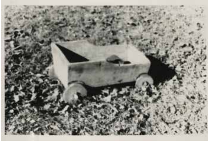
Photograph No. 2: Photograph PAE/F/24.38.X/703.63.15/01 – Dzianisz (near Nowy Targ) – a children's handcart, source: http://www.pae.us.edu.pl/items/show/8139 , access: 10.07.2020.

by accident can be found. However, the quality of the photo does not allow us to examine the toy thoroughly. It is probably a four-wheel handcart or some other miniaturised wooden vehicle.