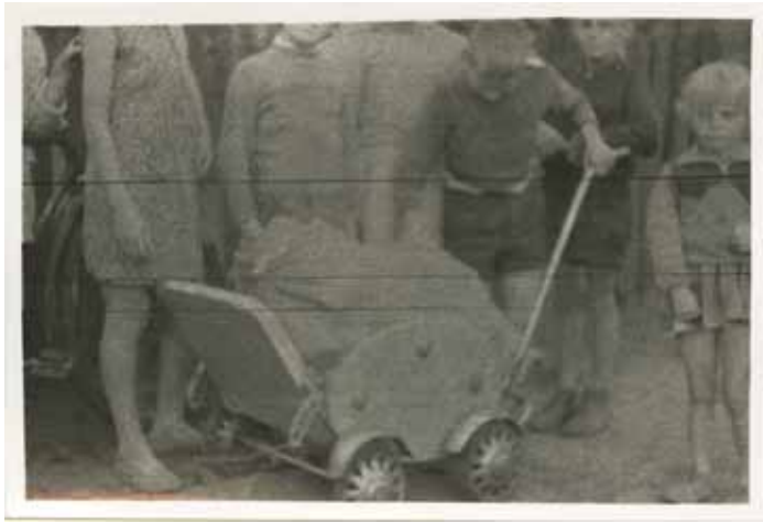
Photograph No. 3: Photograph PAE/F/7.24.VIII/1192.61.16/01 – Jasień (near Lubsko) – a children’s cart, source: http://www.pae.us.edu.pl/items/show/619 , access: 10.07.2020.