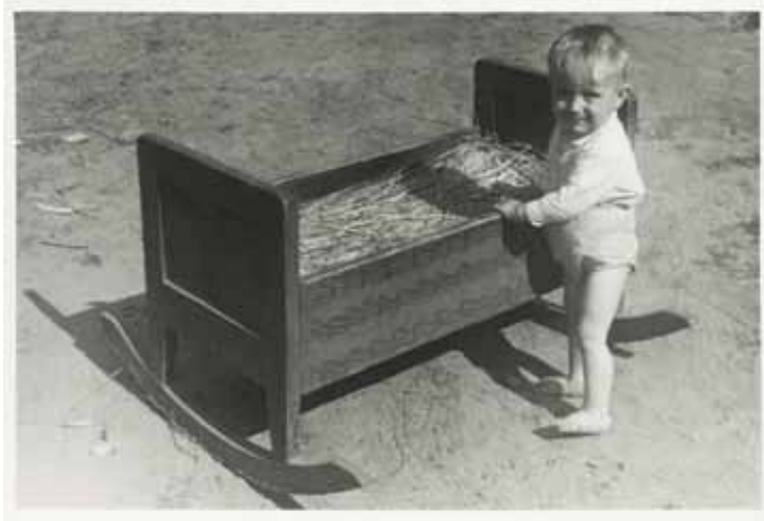
Photograph No. 8: Photograph PAE/F/33.25.VIII/832.65.25/01 – Paszki Małe (near Radzyń Podlaski) – a ground cradle

the cradle fits into the thematic area of material culture, related to household accessories. A child in the photograph taken in 1966 in Książnica Śląska (near Dzierżoniów) not only demonstrates “its own” cradle, but indirectly shows its play-related use. Putting the closest objects into motion is one of the first games a child can play alone.