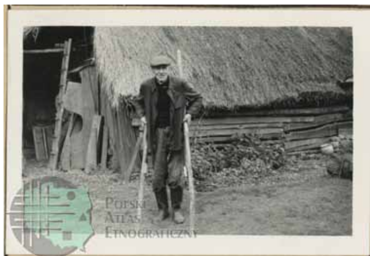
Photograph No. 18: Photograph PAE/F/21.30.IV/473.62.7/01