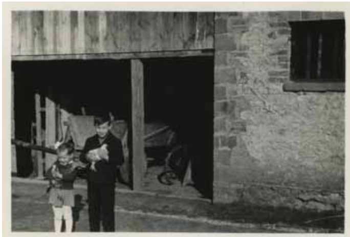
Photograph No. 10: Photograph PAE/F/21.30.IV/473.62.34/01 – Lubojna (near Częstochowa) – a children's outfit, source: http://www.pae.us.edu.pl/items/show/6310 , access: 10.07.2020.

The picture of two children, taken in 1962 in Lubojna (near Częstochowa), is equally interesting. The photograph, which was also supposed to document the outfit of a young girl and a slightly older boy, was taken from a relatively large distance against the background of a building which dominated the frame. Due to the way the picture was taken, a person looking at it, instead of focusing on the clothes from that period of time, would instead try to establish what the children are holding in their hands. The answer is farm animals, which is obvious if the photograph is magnified (photograph No. 10).