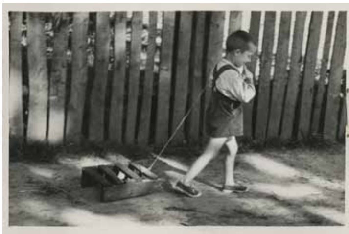
Photograph No. 5: Photograph PAE/F/27.16.VIII/423.61.10/01 – Przeździek Wielki (near Szczytno) – a sled

Amongst 21 photographs of sleds 12 with varying structures, documented in numerous towns and villages in the country, there was only one, in two different shots, taken in the winter scenery. One picture, taken in the village of Przeździek Wielki (near Szczytno), stands out from this group of photographs. It depicts a 4–5 year old boy dressed in summer clothes, walking along a fence and dragging a small wooden sled with a string tossed across his shoulder (photograph No. 5).