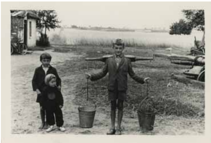
Photograph No. 13: Photograph PAE/F/20.21.III/400.61.24/01 – Orle (near Radziejów) – on-person transport, source: http://www.pae.us.edu.pl/items/show/5311 , access: 10.07.2020.

The photographs show that the children were clearly having fun posing and demonstrating their clothes as well as demonstrating how on-person transport with carrying shoulder poles worked (photograph No. 13), presenting fishing nets (photograph No. 14), or “demonstrating an open carriage” (photograph No. 15, 16). The below photographs were taken in the early 1960s.