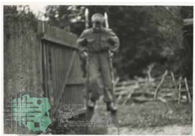
Photograph No. 17: Photograph PAE/F/28.14.XIII/344.61.9/01 – Grom (near Szczytno) – stilts

successfully shows the ludic nature of stilts was discovered. The photo was taken in 1961 in the town of Grom (near Szczytno). It is barely noticeable that a 10–12 year old boy is smiling while demonstrating the use of stilts ( chodzydła ) which shows that this rural tool was used as a source of entertainment for children. This becomes quite apparent when the photo of the boy is compared with the photo in which an older man demonstrates the stilts (photographs No. 17 and 18).