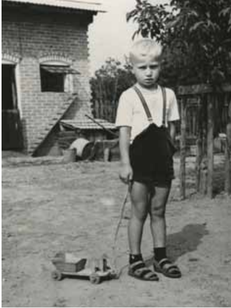
Photograph No. 1: Photograph PAE/ F/32.31.X/1215.69.33/01 – Jastkowice (near Tarnobrzeg) – children’s clothes, source: http://www.pae.us.edu.pl/items/show/12159 , access: 10.07.2020.

Working with archival iconographic material always involves methodological and interpretational difficulties. In the case of the digitalised PAE collection, available descriptions are often insufficient 10 . Doubts arise whether the way of interpreting the photos is correct and exhaustive 11 . Since the Digital Archives of the PAE enable quick access to over twelve thousand photos, the first step of every preliminary research is to choose the terms to be entered into the search engine on the archive website. Terminology connected with ludic issues was found useful when searching for photos depicting rural children’s toys and games in the PAE material, but, as numerous attempts have proved, it is not the only keyword that brings results worth discussing.