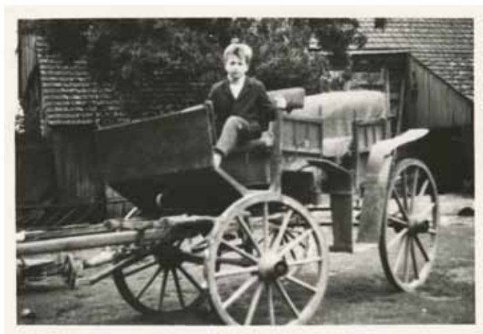
Photograph No. 15: Photograph PAE/F/7.23.VIII/457.61.11/01 – Kopce / Koperno (near Gubin) – a four-wheel open cart

The PAE photos from the “Transportation and communication” section provide information not only about the playtime use of the aforementioned sleds and carts, or a children’s game, particularly enjoyed by older children, of pretending to be a coachman. The photos also document skates (14 photographs), wooden skis (3 photographs), and stilts (4 photographs). Children used the latter for fun. The PAE archives contain no photos of children using skates or skis. However, one photograph that