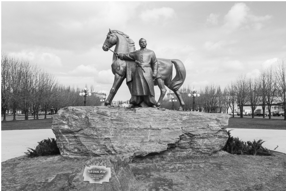
Photograph1. The monument to the legendary founder of the city Kryvyi Cossack Rih, 2011.