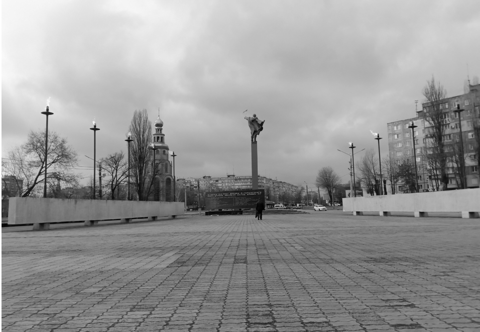
Photograph 2. “Victory” Monument, 1968. Torches are lit in honor of the City’s Liberation Day. On the left is St George’s Bell Tower, dedicated to the memory of Soviet soldiers who died in the “Great Patriotic War”. Date: February 22, 2023.