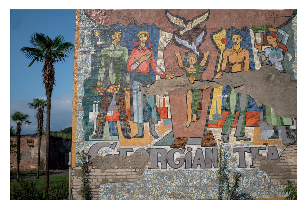
Fig. 1. A mosaic on the wall of a closed tea factory, one of six that operated in Town.