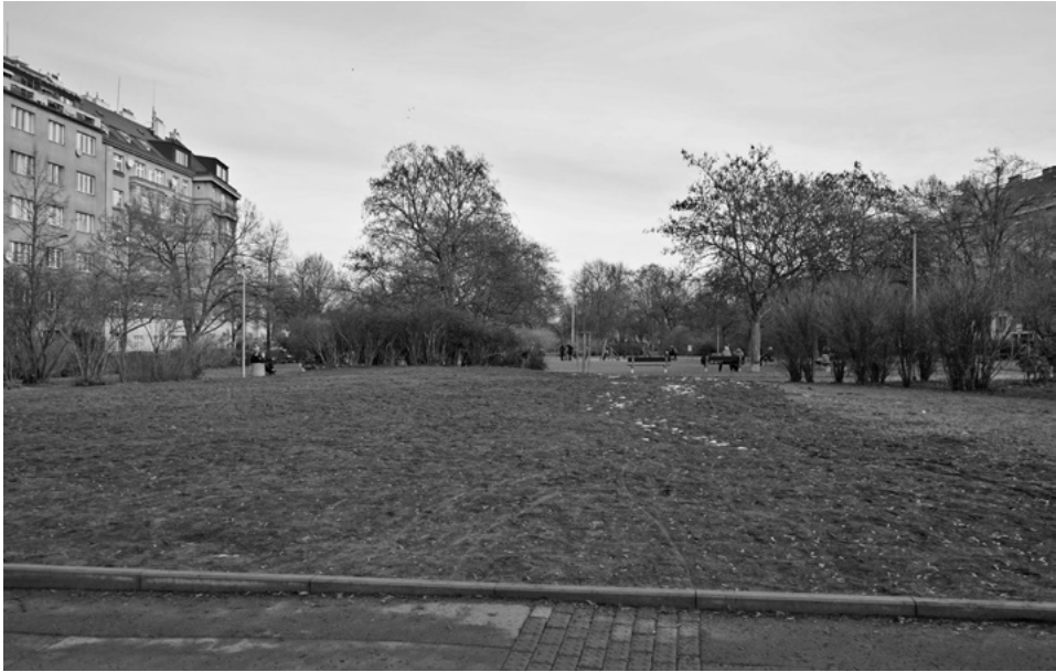
Fig. 1. The former location of the monument as photographed in Spring 2021

of the monument. It also expressed and fit with the overall socio-political atmosphere of the 1970s and 1980s: the era of state socialism labelled “normalization”, which commenced with the invasion of Warsaw Pact armies in 1968 to stifle the liberalization of Czechoslovakian socialism of the 1960s. 5