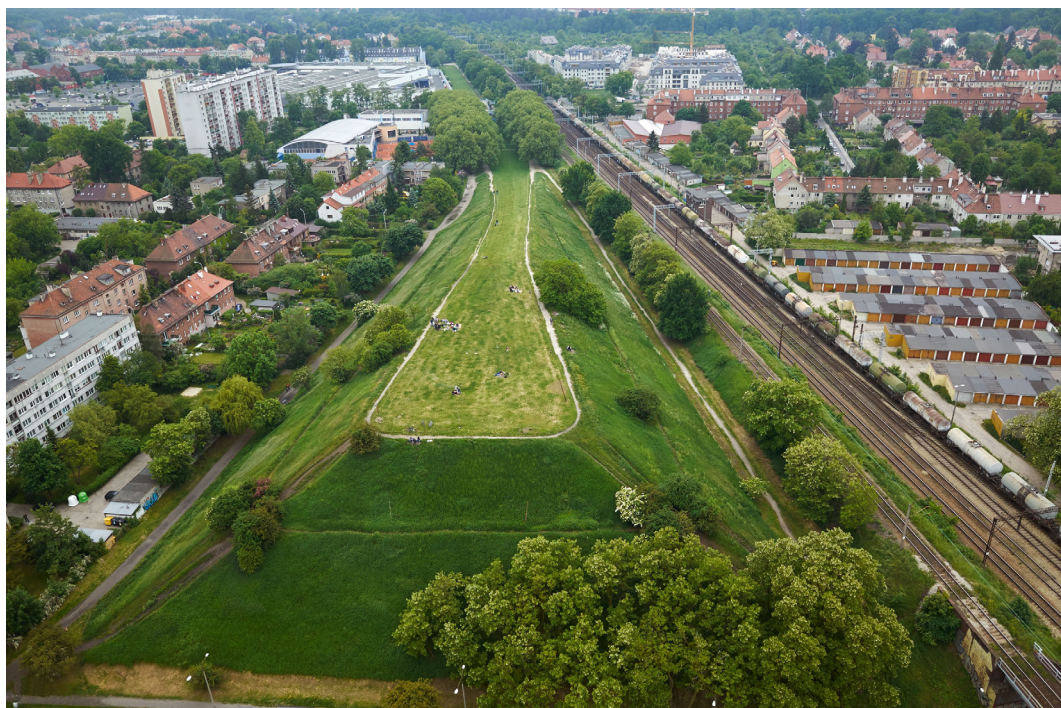
Fig. 2. A view of Wzgórze Gajowickie in Wrocław. A rubbish dump formed at the end of the 19 th century, which changed into a recreational place in the 1930s.

construction investments. Wrocław at the beginning of the 20 th century was divided into 106 regions, which were assigned specific dumps (from 10 to 27 regions per one landfill). It was estimated then that the annual production from such an area was about 2,000 m 3 of rubbish. Thus, in the scale of the whole city, with the number of inhabitants reaching 500,000 at that time, it could have been even 212,000 m 3 . One may suspect that this number grew steadily in subsequent decades, because the city's area increased and further regions were added. An example of a preserved elevation composed of rubbish from 1880 is Wzgórze Gajowickie – which was converted into a viewing point in the 1930s (Fig. 2). Based on these chosen examples, one can observe that waste management issues were not regulated centrally from the outset, but rather developed based on the individual experiences of the authorities in individual centres. Some common features that arise in the case of equally-sized cities are the similar selection of places for rubbish dumps. While this issue seems to be well recognised, in its general framework, issues related to their possible protection or archaeological research have not been the subject of a wider debate in Polish literature.