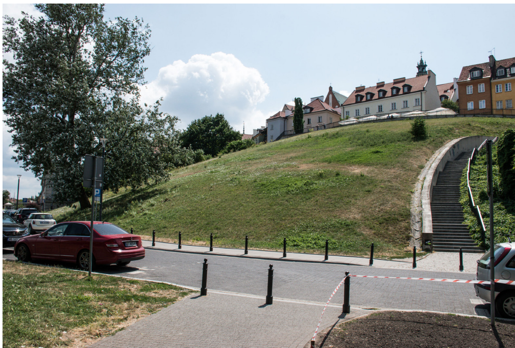
Fig. 1. A contemporary view of the Gnojna Góra in Warsaw. For several centuries, until 1844, it was the main rubbish dump for the city's inhabitants.

production centre. One of them, mainly containing unsuccessful products, measured 80 metres in length, about 40 metres in width and an average of 7 metres in height. It was examined by archaeologists in the 1960s and provided a lot of detailed information, which allowed reconstruction of the production process and the range of wares produced. 5 A more recent example from Poland is Gnojna Góra in Warsaw (Fig. 1), where the deposition of waste began with the location of the city and the municipal authorities, and with great difficulty it only ceased by around 1844, reaching a height of up to 25 metres in places. The site is now surrounded by conservation care and operates as an important repository of monuments of the past. This centuries-old composition has long attracted the attention of archaeologists, causing at the same time unprecedented problems associated with its exploration. 6 Similar types of places are something isolated in the past. What was the exception over a span of several hundred years became the norm in the second half of the 19 th century in terms of scale, dynamics and the amount of man-made and stored waste.