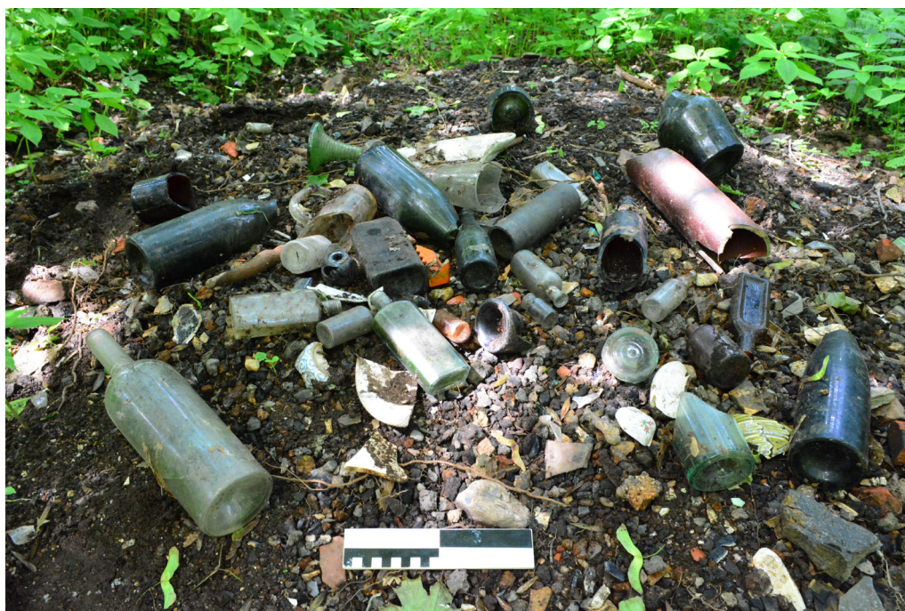
Fig. 3. A view of artefacts left by amateur foragers on the surface of a landfill site in the Las Rakowiecki in Wrocław. This place was one of the largest rubbish dumps in the city in the first half of the 20 th century.

argue that most of these types of sites were destroyed by modern buildings before archaeologists managed to carry out research there. 28 In Poland, as well as similar voices existing in other countries, there is still an anachronistic view that archaeology, when it comes to the most recent periods, is not in a position to bring anything new. 29 It has been shown many times that such reasoning is wrong.