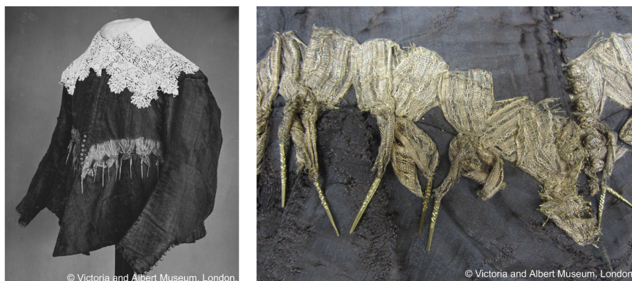
Fig. 3. Doublet, c. 1630-1635, inv. no.: 185-1900, Victoria and Albert Museum, London.