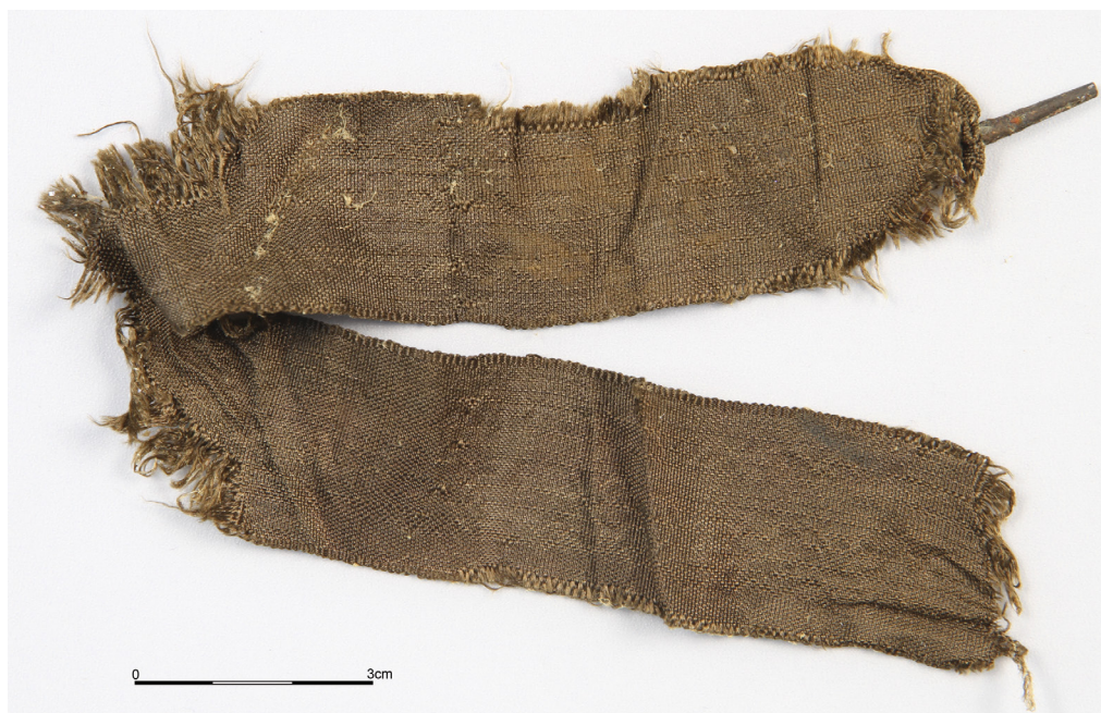
Fig.11. Silk lace, 17 th -18 th century, inv. no. EMXXXIII/27/2657, Museum of Archaeology and History in Elbląg.