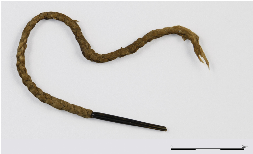
Fig. 9. Silk lace, 16 th century, inv. no. EMXXXI/22/755, Museum of Archaeology and History in Elbląg.