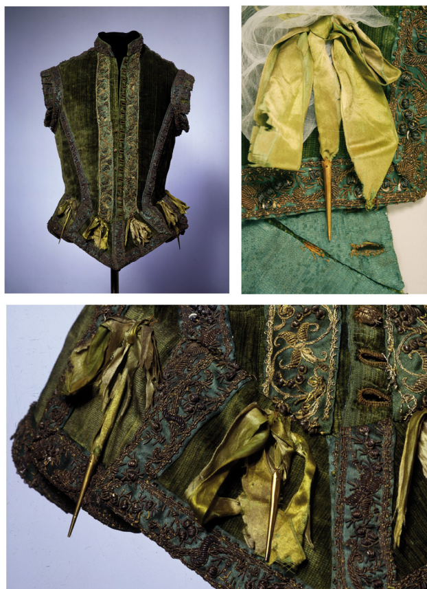
Fig. 4. Doublet, c. 1580, accession no.: 1978.128, Metropolitan Museum of Art, New York.