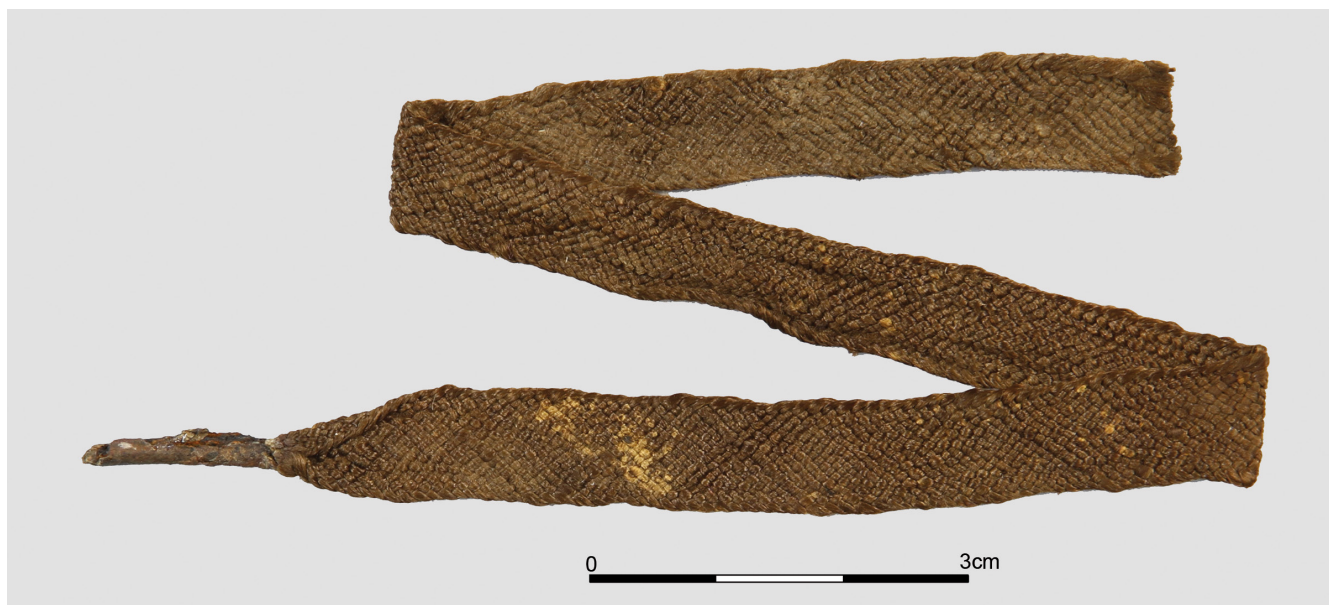
Fig. 7. Silk lace, 13 th century, inv. no. EMXXII/32/12.787, Museum of Archaeology and History in Elbląg.