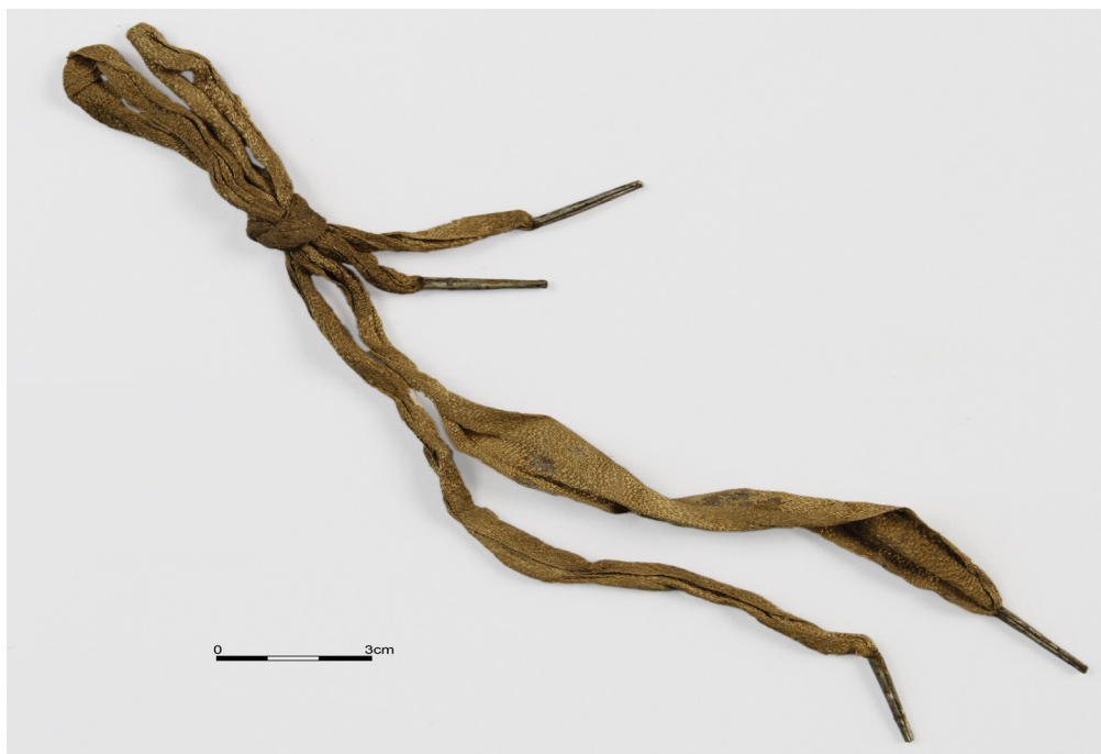
Fig.10. Pair of silk laces, 17 th century, inv. no. EMXXX/34/5545, Museum of Archaeology and History in Elbląg.

is made of iron. Like the other aforementioned tags, this one was also only tightened on the ribbon, without using a rivet. Typologically, this and all other Elbląg chapes correspond to Type 1 according to Krabath's typology (cylindrical and slightly cone shaped). 24