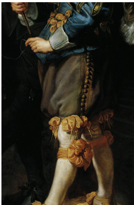
Fig. 2. Portrait of Albert and Nicolaas Rubens , Peter Paul Rubens, 1626-1627, Liechtenstein Museum, Vienna. Close-up.

pregnant women. In the Middle Ages, women’s dresses could be fitted with laced slits at the sides or in front of the dress. On the basis of surviving iconographic sources, it seems that lacing was mainly used in kirtles worn as working dress. In formal outer gowns noticeable lacing appeared at the end of the 14 th century. Depictions of this type of dress with fastening running in the front can be found in European iconography of this period. A good example is offered by illuminations from the Willehalm (1387-1395), which was a manuscript commissioned by