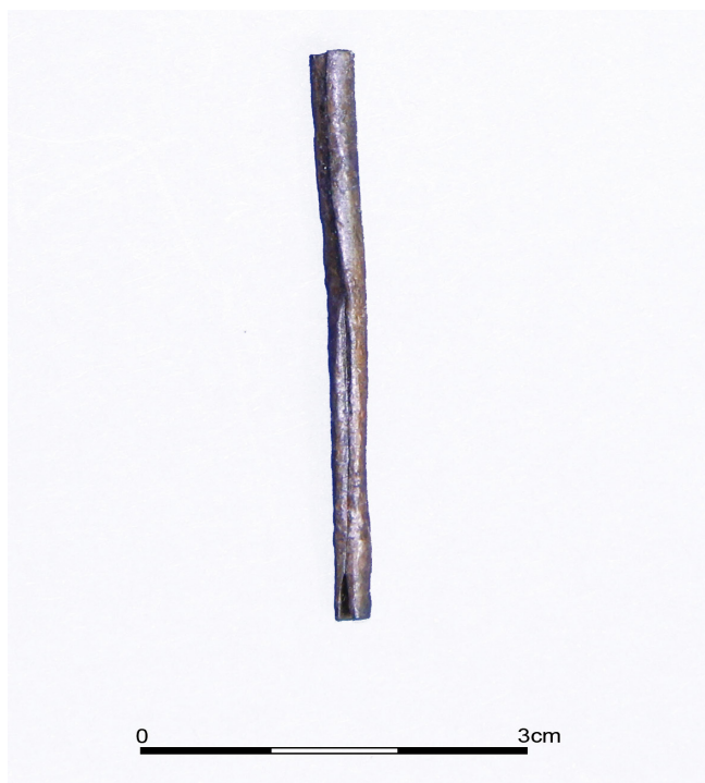
Fig. 8. Lace chape, 14 th century, inv. no. EMII/435, Museum of Archaeology and History in Elbląg.

Another medieval artefact is a lace chape (inv. no. EMII/435) which is dated to the turn of the 13 th and 14 th century (Fig. 8). The lace end was made of thin copper alloy sheet. The chape is quite long, measuring almost 5 cm. Its diameter at the widest point is about 0.4 cm. The fitting slightly narrows towards the end and has no trace of a rivet, so it must have been simply clamped on the ribbon or thong.