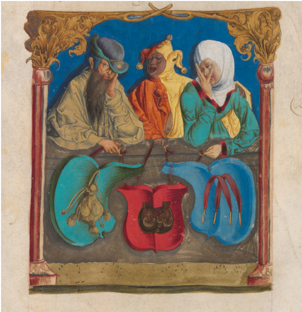
Fig. 6. The coat of arms of the purse-makers guild, Balthasar Behem Codex, c. 1505, Jagiellonian Library, BJ Rkp. 16.

by S. Krabath, who distinguished seven types of these fittings. 12