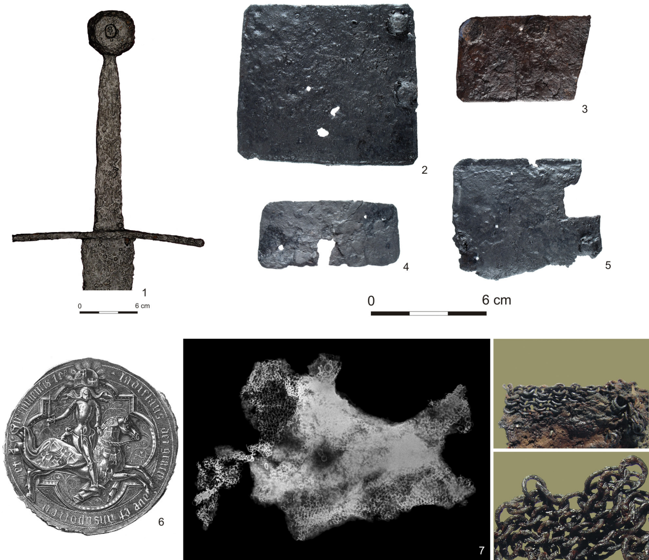
Fig. 5. The 14 th century elements of weaponry connected with Sanok Land: 1 – Jaśliska vicinity, part of the sword. Photo D. Szuwalski; 2-5 – Manastrzec, “Sobień” castle, coat of plates elements. Photo D. Szuwalski; 6 – seal of Władysław II of Opole. After Vossberg 1854; 7 – Krosno, fragment of mail (D. Szuwalski and RTG photo).

were covered with leather armour, according to Tatar fashion. This armour protected both the torsos and the heads of the animals. 37 The other mention was recorded in the necrology and laudation of Duke Volodymyr Ivan Vasylykovich, written in 1287. It specifies ‘bron doshchatyye’ (‘бронѣ дощатые’) – armour made from plates, for which (as well as for 50 marks of marten skins and for five bales of bright red silk) the duke bought the village of Berezovychy in Volhynia from a boyar named Fedorko. 38 According to A. N. Kirpichnikov, these mentions and the appearance of the term