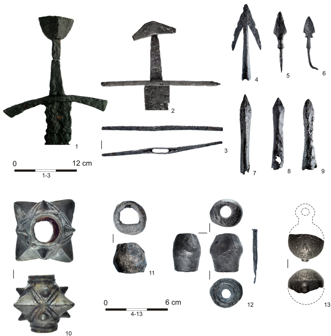
Fig. 2. Elements of weaponry from Sanok and its vicinity in the time of the Halych-Volhynian Duchy: 1 – Krosno, part of the sword; 2 – Wisłok Wielki, part of the sword; 3 – Sanok – castle hill, cross guard; 4-6 – Sanok – castle hill, arrowheads; 7-9 – Sanok – castle hill, bolt heads; 10 – Niebieszczany, bronze mace head; 11-12 – Sanok – castle hill, lead mace heads; 13 – Trepcza, bronze war-flail.

and sporadically used sabres, 23 these comprised maces and flails. 24 Sabres, maces and flails were weapons that were borrowed from the nomadic milieu. Arrowheads with tangs and leaves of various shapes 25 were in common use. Such arrowheads were almost completely unknown to western neighbours, where artefacts with