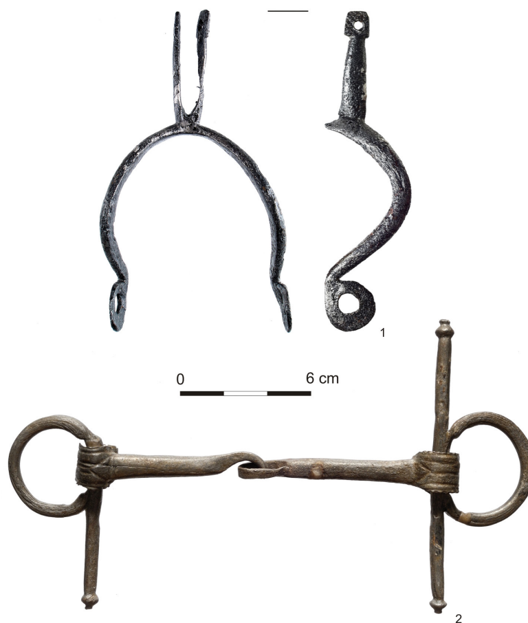
Fig. 6. The 14 th century elements of equestrian equipment from the Sanok Land: 1 – Sanok - castle hill, spur; 2 – Mymoń, ‘Zamczysko’, bit.

appearance of warriors from Crown Ruthenia. What can solely be used are two seals of Duke Władysław II of Opole from the period of his governorate of Ruthenia on behalf of Louis of Anjou King of Hungary. On one of these the duke is depicted on a throne with a sword provided with a discoid pommel. The other seal shows the duke on horseback with a crested great helmet on his head. He is protected with a covered breastplate with chain belts (‘mameliere’), to which a sword and a dagger are attached. The latter is suspended on the knightly belt. His legs are protected with defences known as poleyns (Fig. 5:6). 68 As known from analogies, such a set of a clearly Western European nature could only be afforded by social elites of this period.