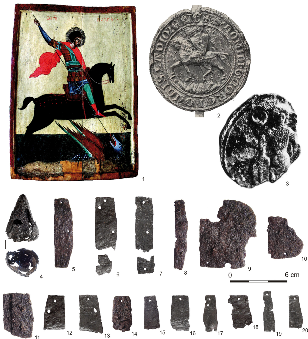
Fig. 4. Iconographic representation of arms and armour as well as elements of armour in the time of Halych-Volhynian Duchy: 1 – the icon from Stanylia, Ukraine. After Helvytovych 2004; 2 – seal of Jurij I Lvovych. After Lewicki 1898; 3 – seal of Lev Danylovych (?). After Lappo-Danilevskii 1907; 4 – Sanok-Biała Góra, ‘Zamczysko’, cone final of helmet. 5-20 – Sanok-Biała Góra, ‘Zamczysko’, lamellar or scale armour plates.

These are mainly artefacts with tangs (Fig. 2:5-6), 34 although examples with sockets and barbs are also encountered (Fig. 2:4). A universal model is represented by parts of equestrian equipment – chiefly spurs with goads and rowels which are first of all known from ‘Horodyszczce’ in Trepcza and from the “castle hill” in Sanok (Fig. 3). 35