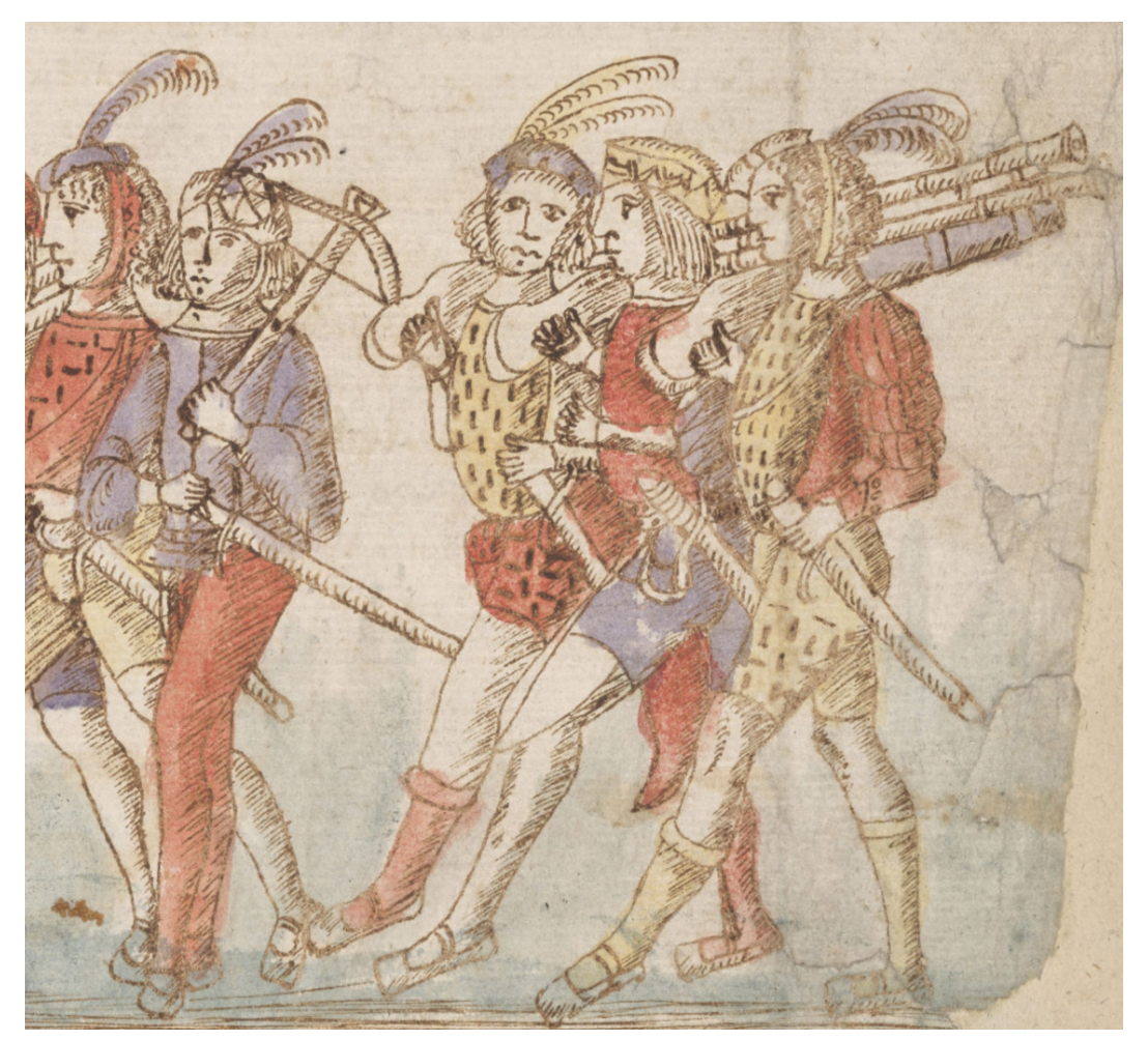
Fig. 10. Infantry with firearms. After: Werner Rolevnick, Fasciculus temporum, fol. 150r.

halberds was successfully used from the 14<sup>th</sup> century. It was not possible to change this tactic in a short time. On the other hand, in England, where the main force of the infantry were shooters armed with longbows, the slow spread of firearms was associated with a strong belief in the superiority of these weapons over guns. Consequently, soldiers using longbows were not tempted to replace them with matchlock handgonnes.<sup>44</sup>