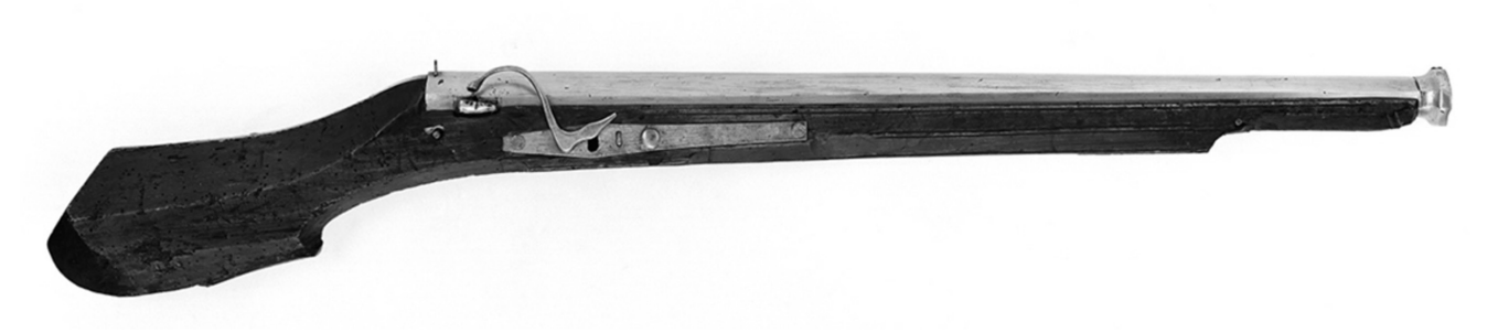
Fig. 11. Matchlock handgonne. Probably from the end of the 15<sup>th</sup> century, Geneva, Musée d'Art et d'histoire, inv. no. AD 8171.

Hungarian army. King Matthias Corvinus (1443-1490) of Hungary created one of the best European armies at that time. The infantry of his so-called 'Black Army' is known to have had 20% of its shooters armed with firearms by 1481.<sup>46</sup> There were many Poles among the mercenaries serving in the Hungarian army. When the 'Black Army' was dissolved after Corvinus's death, many of them returned to their homeland, where they continued their service as mercenaries. Hungarians also came to Poland with them in search of income, among them experienced commanders - a few of whom we see on Polish payrolls in the 1490s.<sup>47</sup> The strengthening of political and military cooperation between Poland and Hungary at that time was further facilitated by the fact that both thrones were occupied by representatives of the Jagiellonian dynasty. The influx of soldiers from the Hungarian army to Poland had an impact on the structure of infantry units of the Kingdom of Poland, which at that time resembled that of Matthias Corvinus.<sup>48</sup> It should be noted, however, that Hungarian patterns were also introduced in units commanded by Poles and Bohemians serving in the army of the Kingdom of Poland.