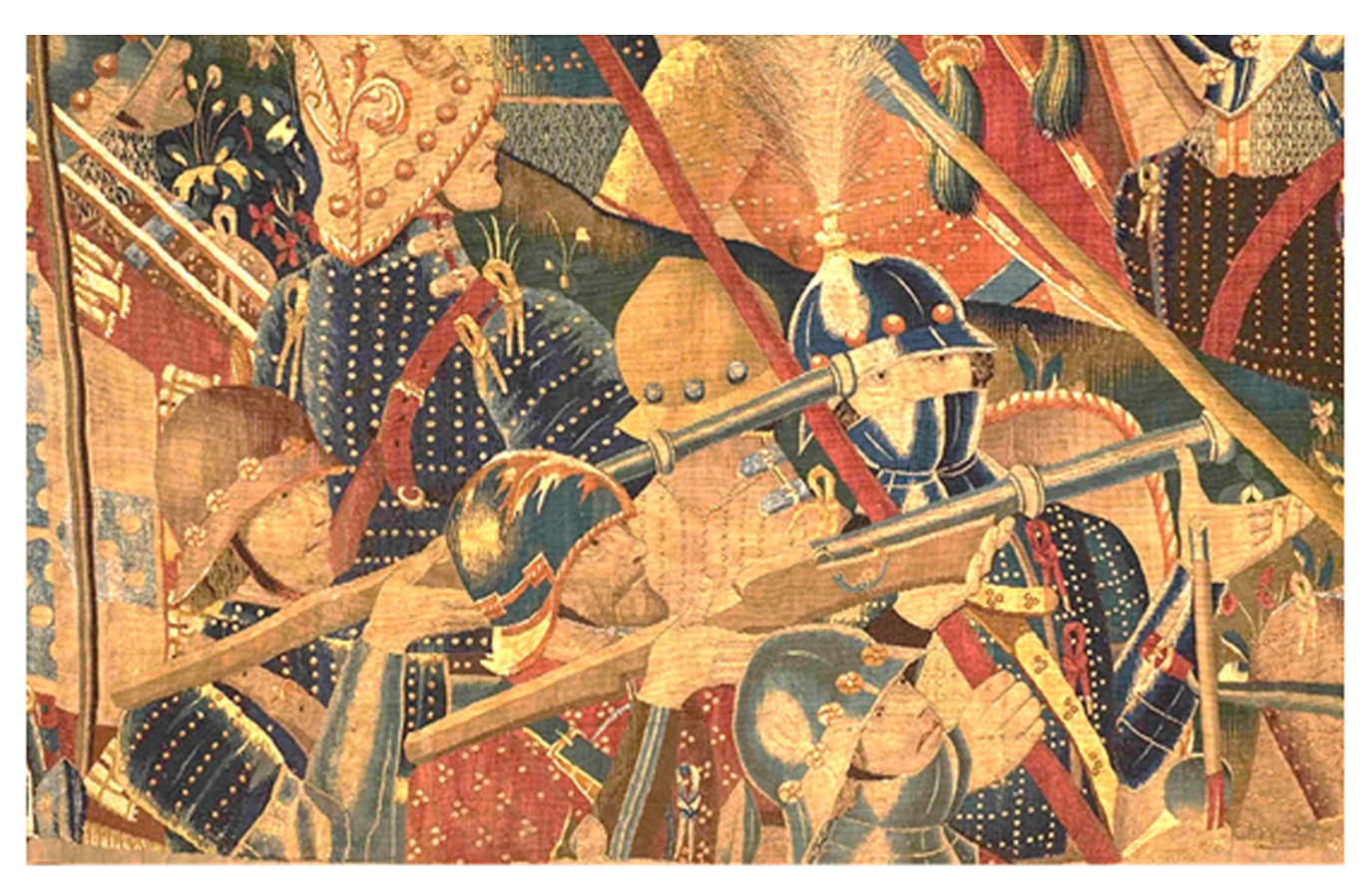
Fig. 4. Portuguese infantrymen with handgonnes, Colegiada de Pastrana Museum in Pastrana, Spain, end of 15<sup>th</sup> century.

Asil and Tangier in the summer of 1471 by the army of Alfonso V, King of Portugal. The ruler, who wanted to commemorate the victorious expedition, personally commissioned the making of the tapestries. It is not known exactly when the tapestries were ordered, but it