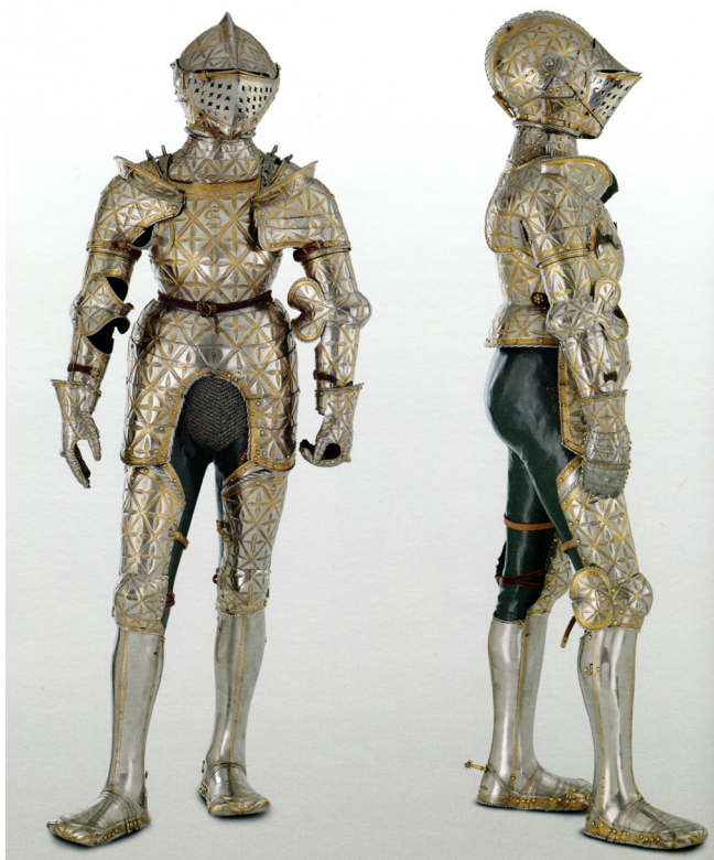
Fig. 1. Armour of the Young King Sigismund Augustus from the Wawel Royal Castle Collection.

reality, on 17 February 2021, the armour was once again handed over, this time to a Polish collection (Wawel Royal Castle). In a sense, therefore, the intention of Ferdinand Habsburg was finally realised, but – it should be emphasised – the armour never became the property of Polish rulers or the Polish state.