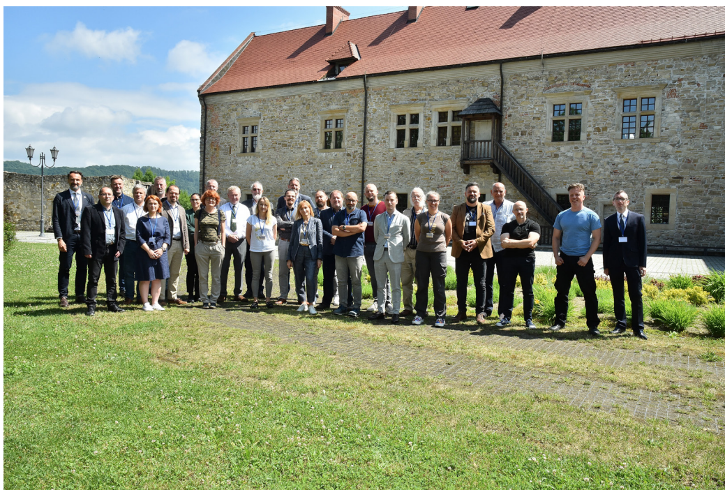
Fig. 2. Conference participants in front of the royal castle in Sanok.