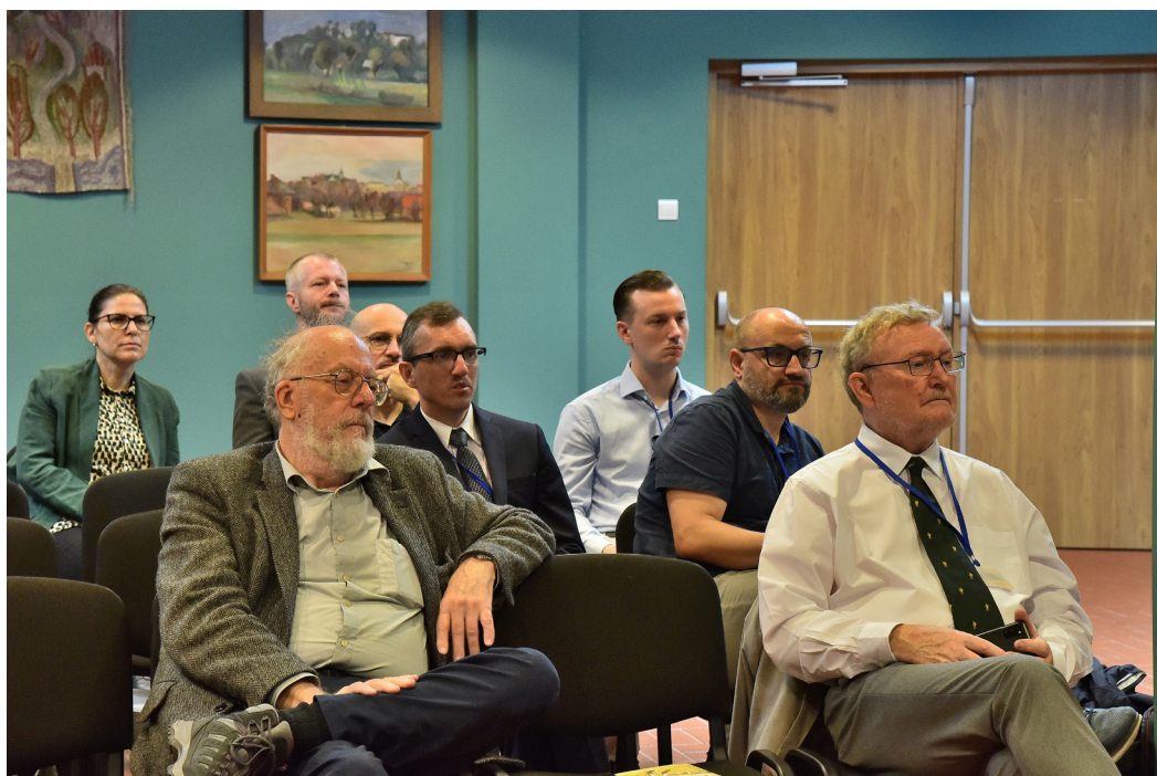
Fig. 4. Conference participants during proceedings.

Mail in Obeliai (Lithuania) Cremation Grave , Sigita Mikšaitė (Lithuanian National Museum in Vilnius, LT) discussed finds of mail elements in Lithuanian graves from the 13 th -15 th centuries, including, above all, the largest fragment – most likely a mail with a sleeve – discovered in the Obeliai cemetery.