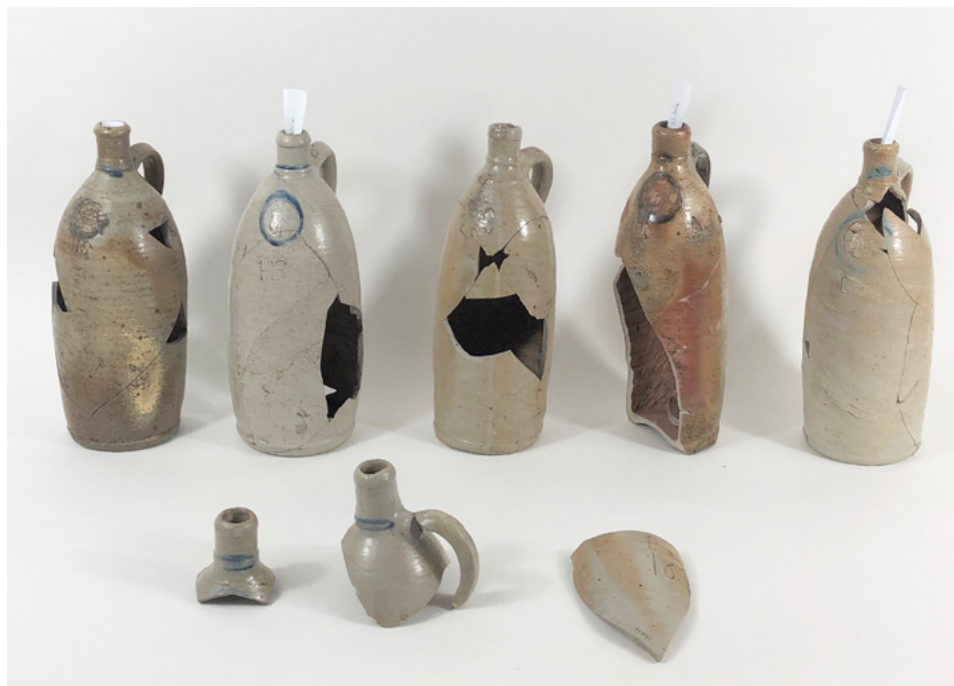
Fig. 7. Stoneware mineral water bottles found on the site of the Saxon Palace in Warsaw, height – 27–29 cm.

“Pharmacy to His Royal Majesty’s Court” was the legacy of the court pharmacy of the Saxon Electors (Wenda 1917: 23).