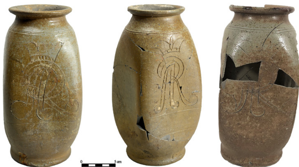
Fig. 1. Stoneware jars from the Saxon Palace in Warsaw.

The royal monogram of the Saxon rulers of Poland – crowned, intertwined letters “AR” – is incised on one side of the vessels (Fig. 1). The monogram on the jars is exactly