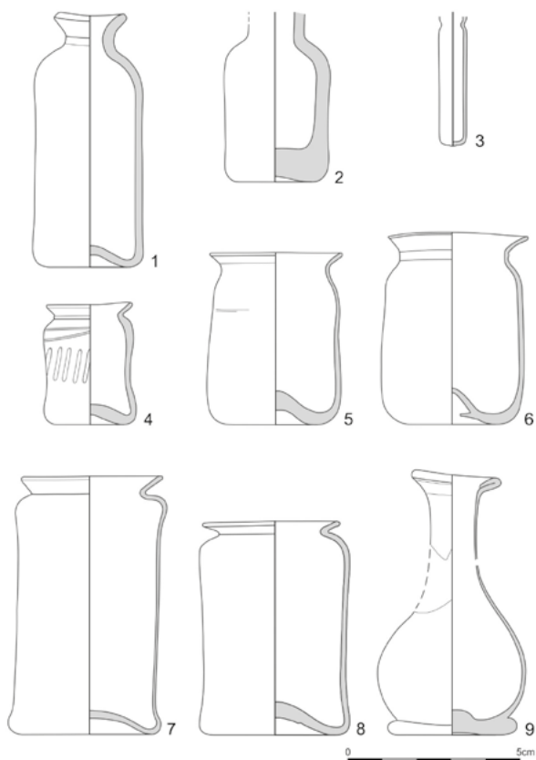
Fig. 5. Selected glass vessels from the court pharmacy in the Saxon Palace in Warsaw. 1, 2 – bottles; 3 – ampoule; 4–8 jars; 9 – vial, so-called zakonniczka . Drawing by U. Skwara-Nieckuła.