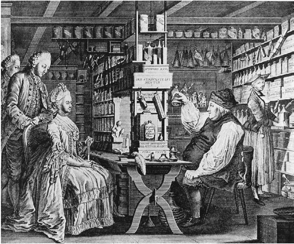
Fig. 4. Country Pharmacy , print showing French aristocratic customers at Michael Schüppach's pharmacy on the Dorfberg in Langnau in Switzerland. Author G. Locher (1774), engraver Bartholomäus Hübner (1775).

in Baden-Württemberg) or in an unspecified manufactory in Saxony. 8 Waldenburg produced large stoneware vessels for pharmaceutical and chemical companies (see, for example, Kowalczyk 2014: 31).