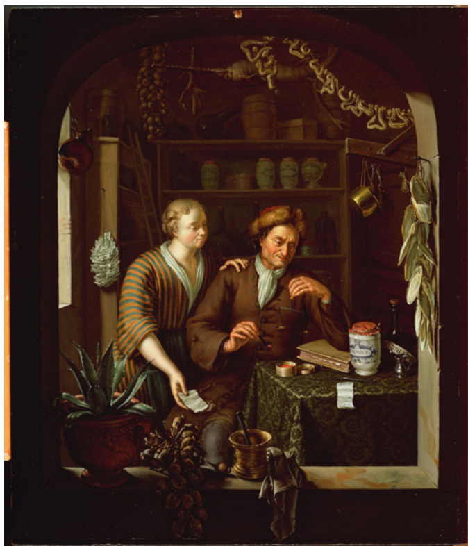
Fig. 3 The Apothecary , Frans van Mieris, 1714, collection of the Amsterdam Museum. In the foreground, a jar covered with parchment or leather.

time the palace changed its role. Although it remained in the hands of the Electors of Saxony, they used only a small part of the main building as an accommodation for their diplomatic and trade missions. The rest of the palace was divided into smaller sections, rented as offices and private apartments. It is possible that the pharmacy was still operating, but it is doubtful that new batches of storage vessels marked with the royal monogram were ordered for it (Borowska 2020: 114). In 1797, the palace was purchased by the King of Prussia, Frederick William II, and ceased to have a residential function. It appears that the pharmacy also ceased to exist at that time (if it had not been closed earlier, after the death of Augustus III).