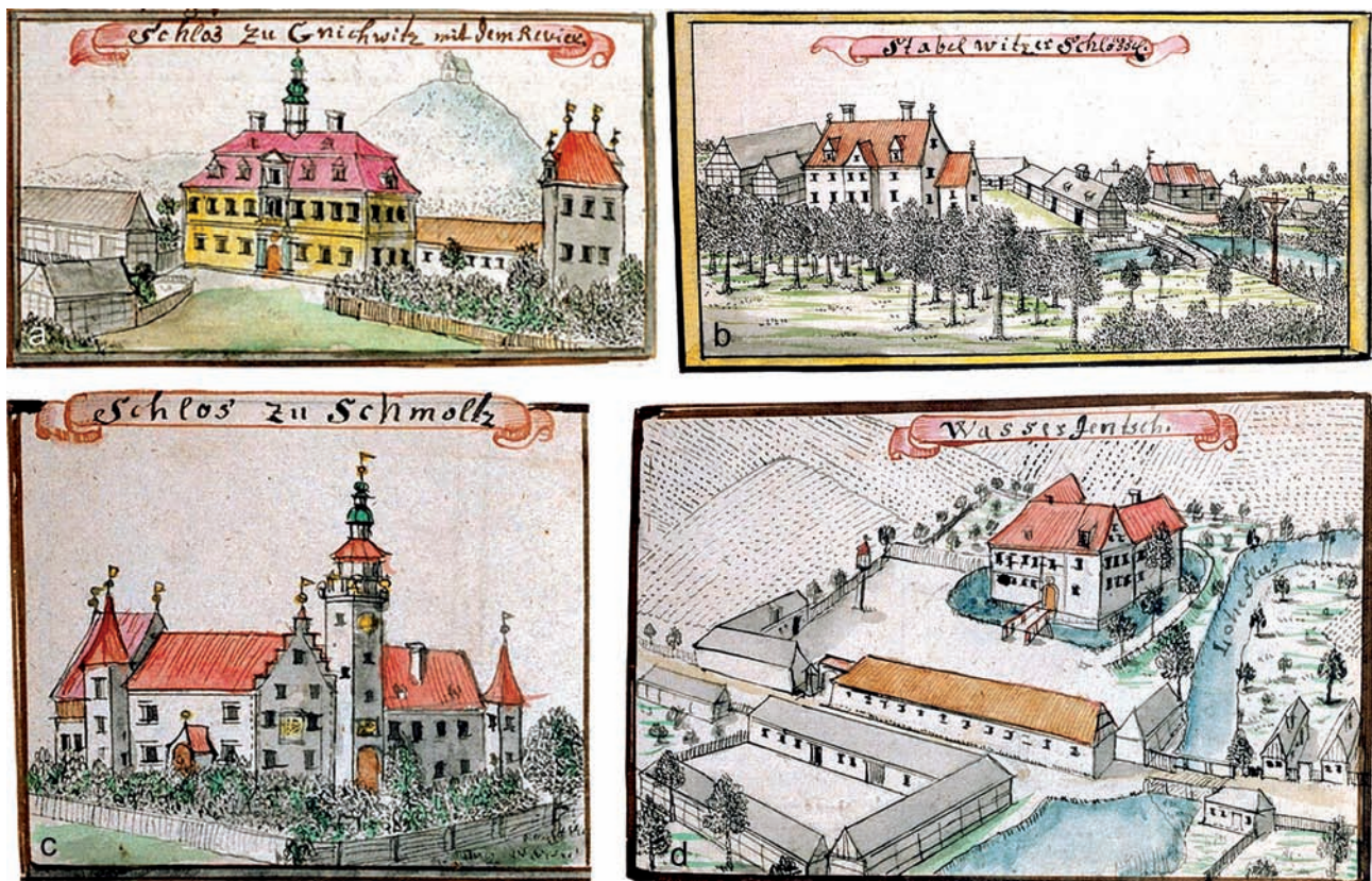
Fig. 8. Manor houses according to F.B. Werner's drawings from the middle of the 18th century: a – Gniechowice; b – Stabłowice; d – Smolec; e – Komorowice (Topographia Silesiae, Silesian-Lusatian Department of the University Library in Wrocław, Iconography Department)

Knight Henry von Kalow, known from the years 1342-1351, was mentioned in written sources as the hereditary lord of the village of Pracze or as Henry