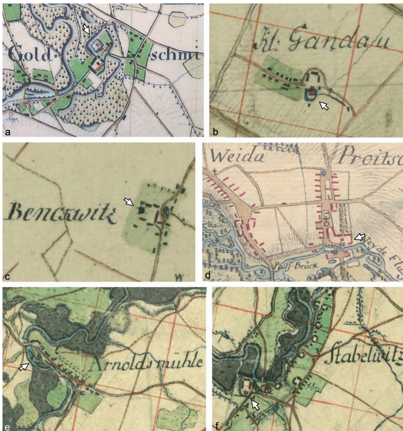
Fig. 5. Villages according to the maps from the second part of the 18th and first half of 19th century with localization of manor houses: a – Złotniki; b – Gądów Mały; c – Bieńkowice; d – Pracze Widawskie; e – Jarnołtów; f – Stabłowice (Cartography Department of Berlin State Library, Prussian Cultural Heritage, sign. N 729, N 15140)

on the Bystrzyca River. Later, the Small Złotniki demesne often passed from hand to hand of various citizen families (SUB, V, 367; RWN, 109; RF, I, f. 187, 190, 191, 194; KPW, No. 25). The relics of a well-preserved motte type structure located in the southern part of the present park can be identified with the demesne in Small Złotniki (Fig. 4:b). In the light of the results of the test trench excavations, the materials and