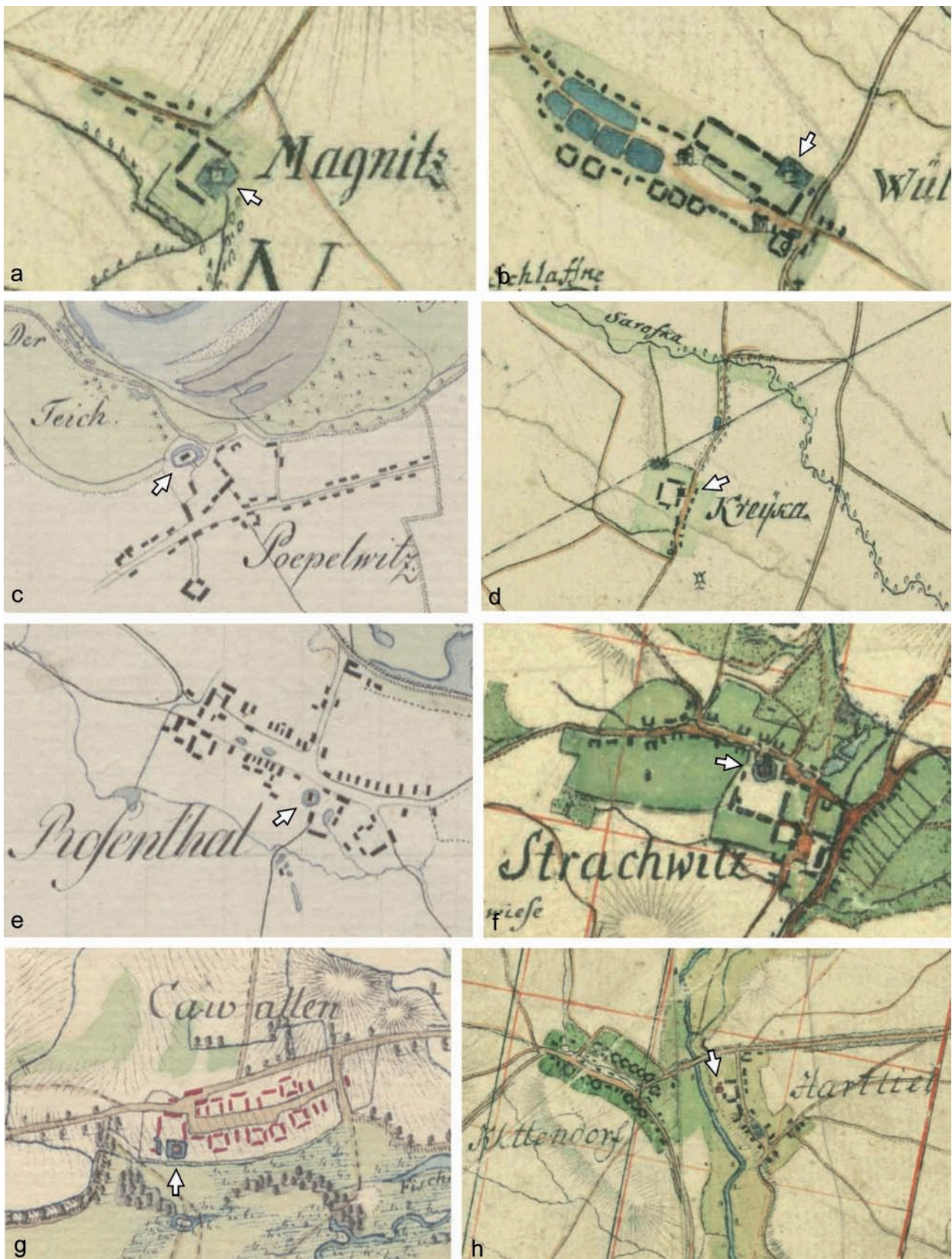
Fig. 3. Villages according to the maps from the second part of the 18th century with localization of manor houses: a – Magnice; b – Wilczków; c – Popowice; d – Krajków; e – Różanka; f – Strachowice; g – Kowale; h – Partyńce (Cartography Department of Berlin State Library, Prussian Cultural Heritage, sign. N 15140, N 16398, N 16402)