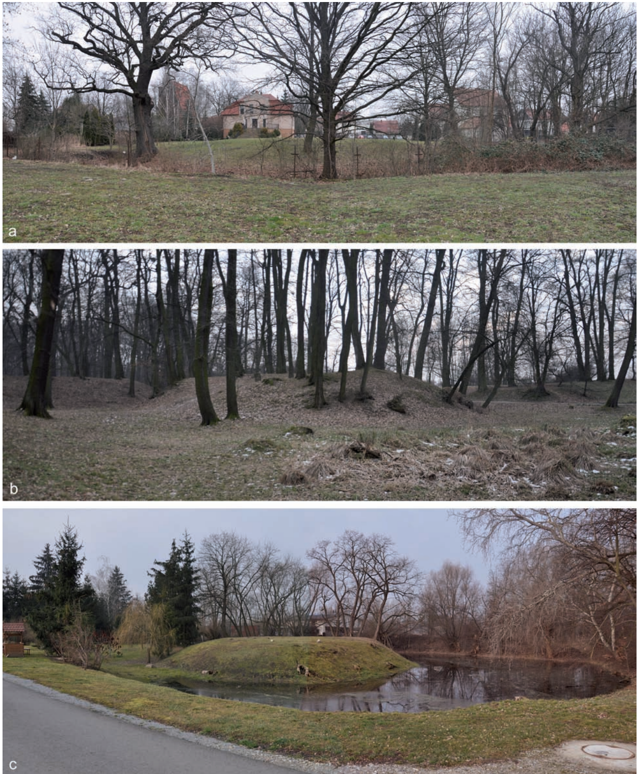
Fig. 4. Views of the mottes in: a – Bielany Wrocławskie; b – Złotniki; c – Nowiny

of Księginice. The land register of the Duchy of Wrocław from the mid-14th century mentions two demesnes in Goldsmeden with a total of 10 mansi . In the light of later records, Stephan's demesne was located in the southern part of the present village. In