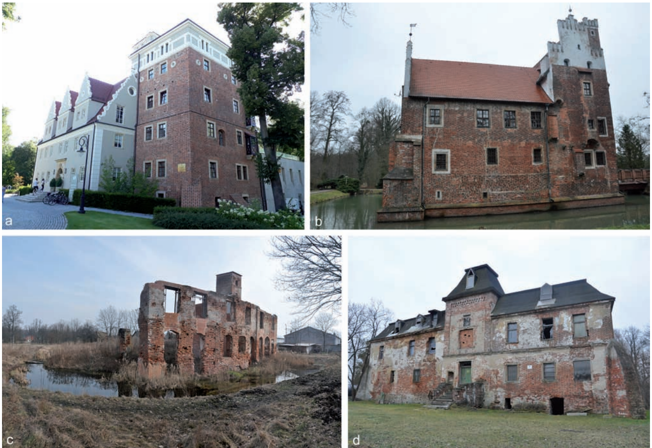
Fig. 7. Views of the manor houses in: a – Ślęza-Lasowo; b – Wojnowice; c – Smolec; d – Komorowice

the 8- mansi demesne of Gądów from burgher Merkelo Schertelzan. Still in the same year, John of Luxemburg allowed him to incorporate the demesne, one part of which he received as a fief from the bishop of Wrocław, and the other from the Trzebnica monastery. In the second half of the 14th century, the village often changed owners, and finally, from 1371, it was owned by Wrocław canons (RS 5676, 5680; AAWr., sygn. BB 26, 28, 32-34; Rś, I, 266, 343). Unfortunately, this structure was also destroyed as a result of the expansion of the city and is now known (Fig. 5:b) from archaeological archive materials ( Turmhügel ) and modern cartography (Kramarek 1963, 163, 194, 195; Kaletynowie, Lodowski 1968, 158; Pawłowski 1978a, 369).