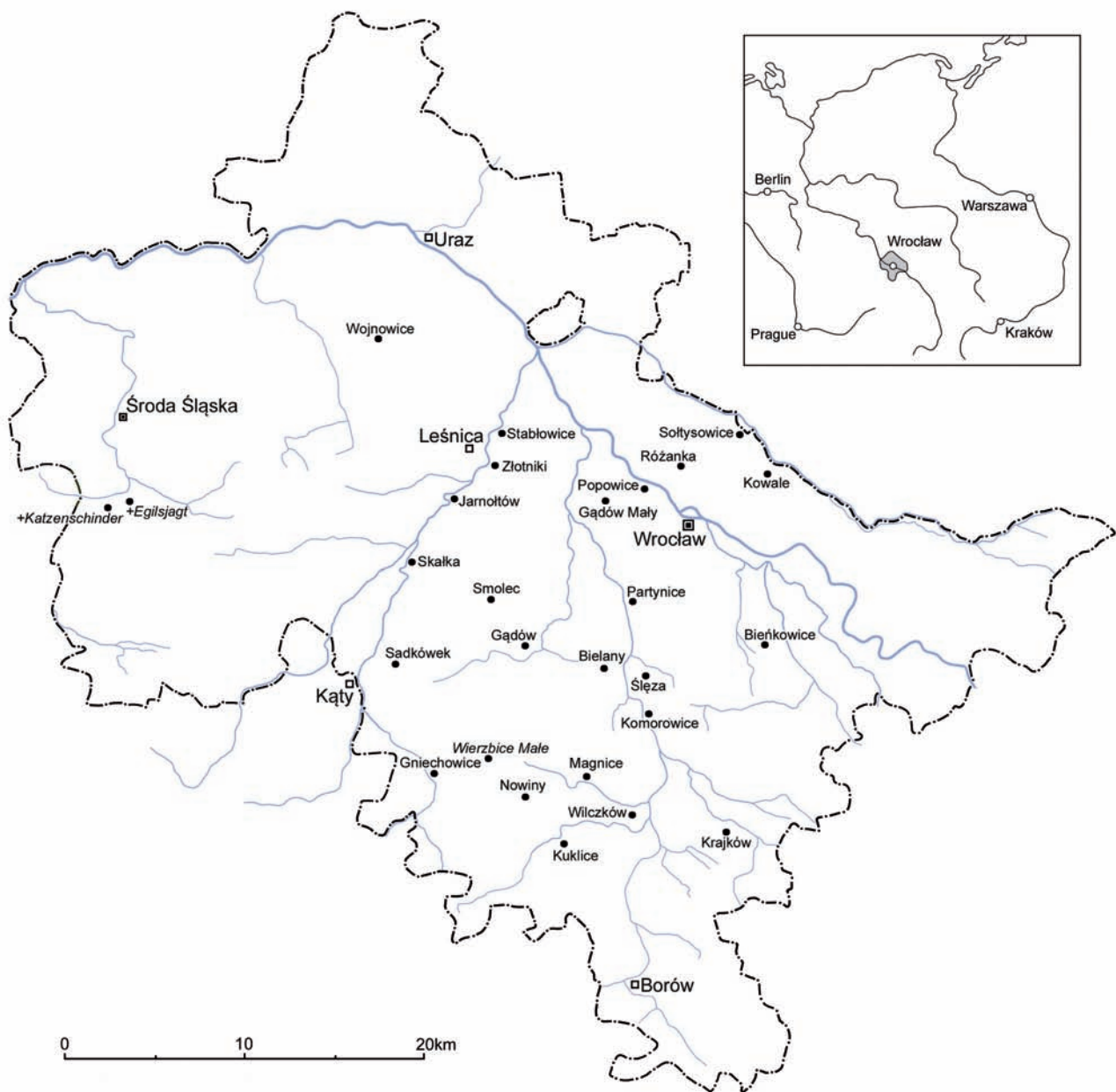
Fig. 1. Map of the duchy of Wrocław at the beginning of the 14th century with the manor houses mentioned in the text (D. Nowakowski)

The article considers the manors built by Wrocław burghers and acquired by them, mainly from knightly families. In total, there are about 30 structures (Fig. 1). Many of them have not survived to modern times, and well-preserved ones, including the oldest motte type structures, are usually poorly explored archaeologically. Interpretation possibilities are also limited by the ambiguous record of written sources. This remark concerns the term curia (German: Hof ) often found in the sources, which in the case of structures located in the countryside was used in relation to fortified residences of lords, demesnes, Schulz manors and parish