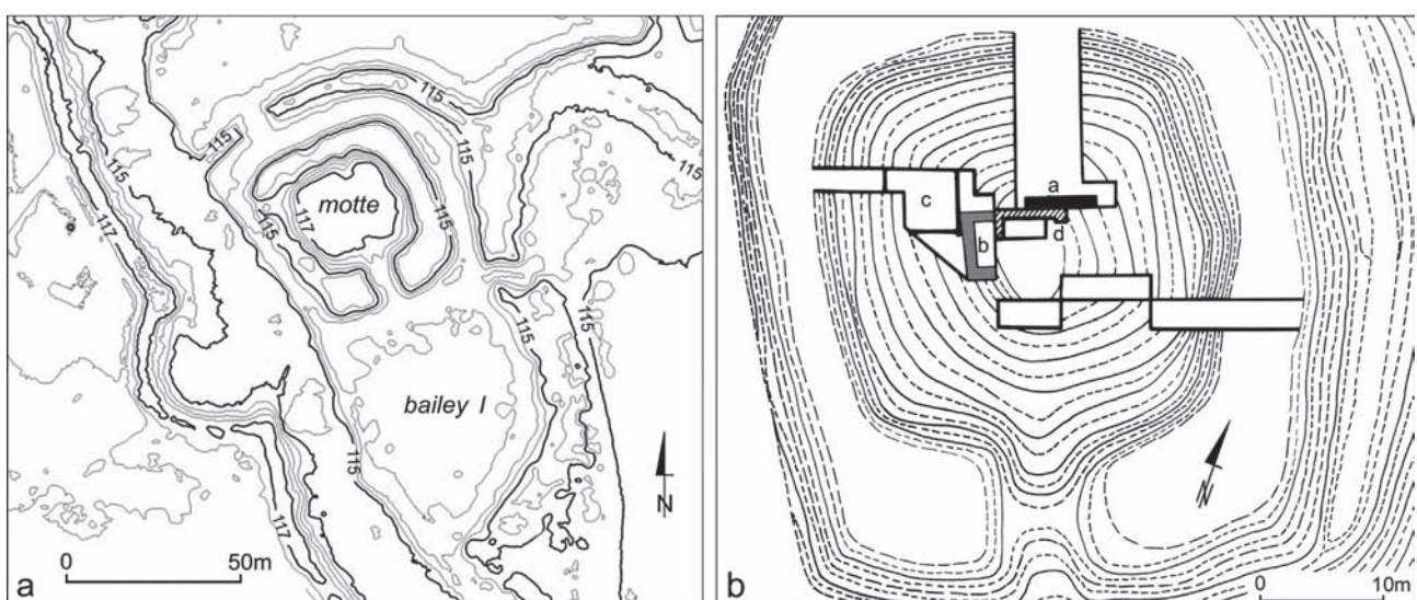
Fig. 2. Sołtysowice: a – topographical plan of the motte-and-bailey; b – the main mound with marked relics of brick residential towers (a, b) and a timber outbuilding (c)