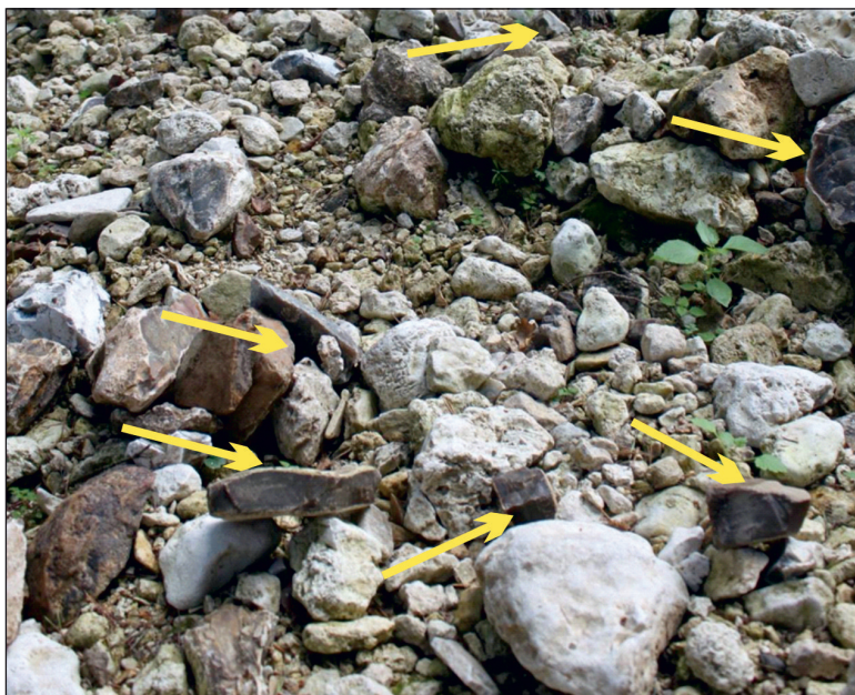
Fig. 2. Chocolate flint nodules in the riverbed of the Udorka stream

the width and the depth of relics of quarry pits and their location in relation to the slope of the Udorka Valley. The results of excavation, supported by the stratigraphic data and datings, confirmed that there were multiple episodes of prehistoric activity at the site at the end of the Pleistocene and the beginning of the Holocene (Sudół-Procyk et al. 2021b).